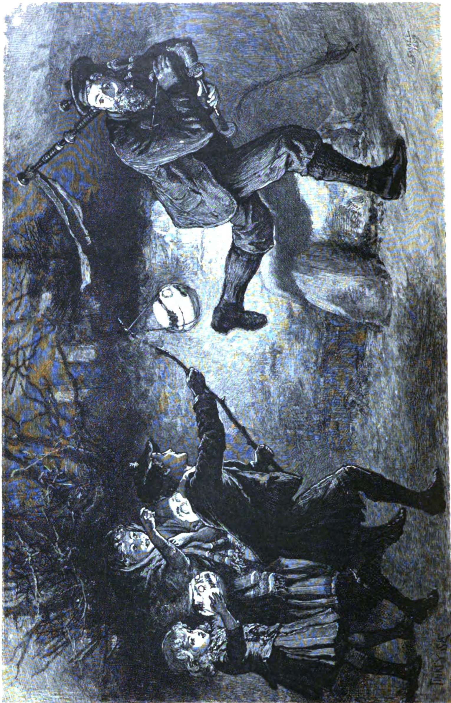
“FROM OUT OF THE DUSK OF THE WALL.”