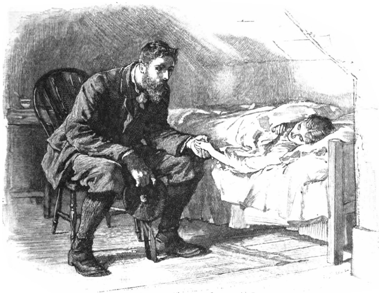
" SHE TRIED TO LIFT HER WASTED HAND TO MEET HIS."

"Hector," she asked, "what night was Halloween night? I have not been thinking of such things."