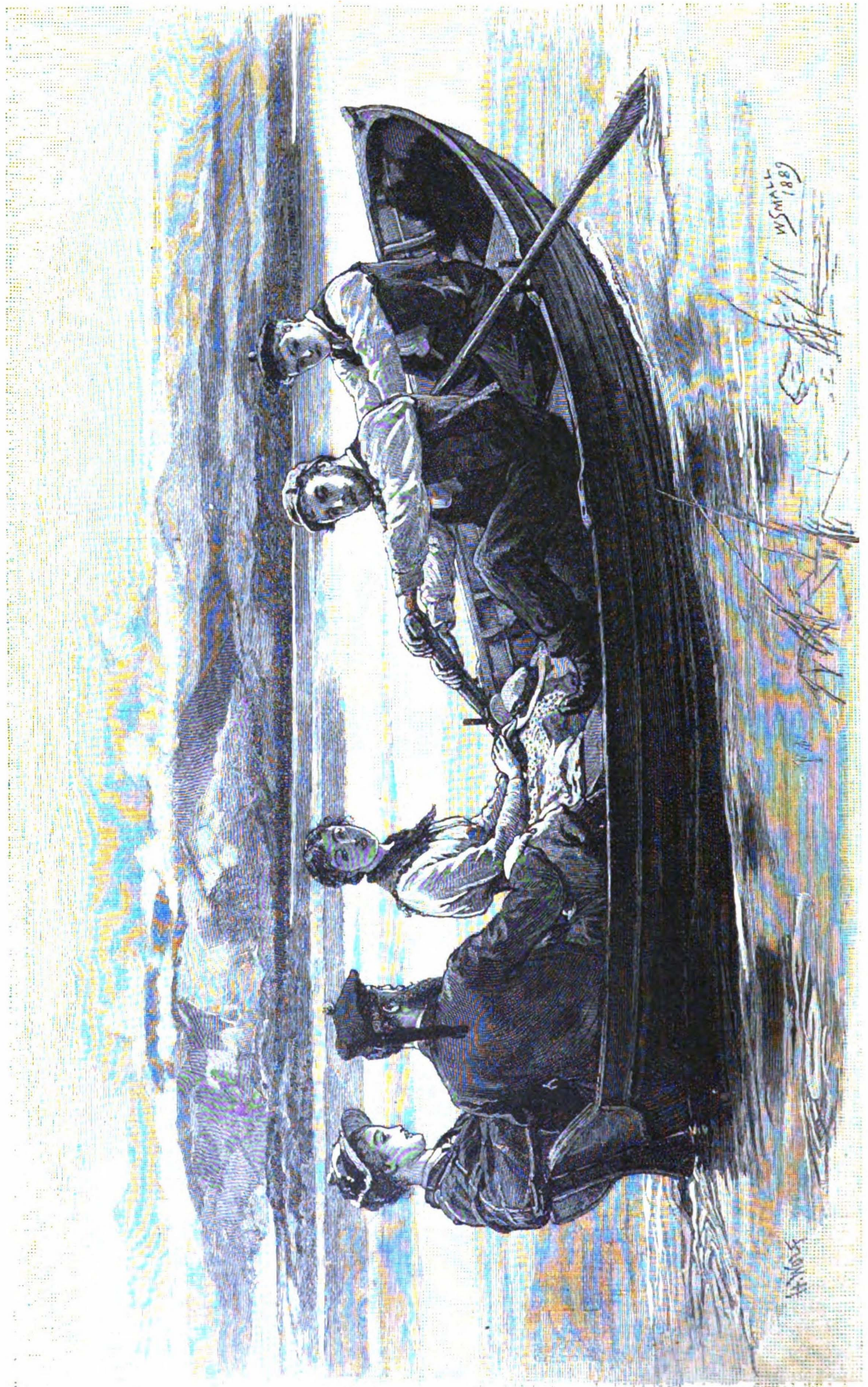
"FLORA AND HE SITTING TOGETHER IN THE STERN OF THE BOAT, AND ALL OF THEM SINGING THE 'FEAR A BHATA.'"