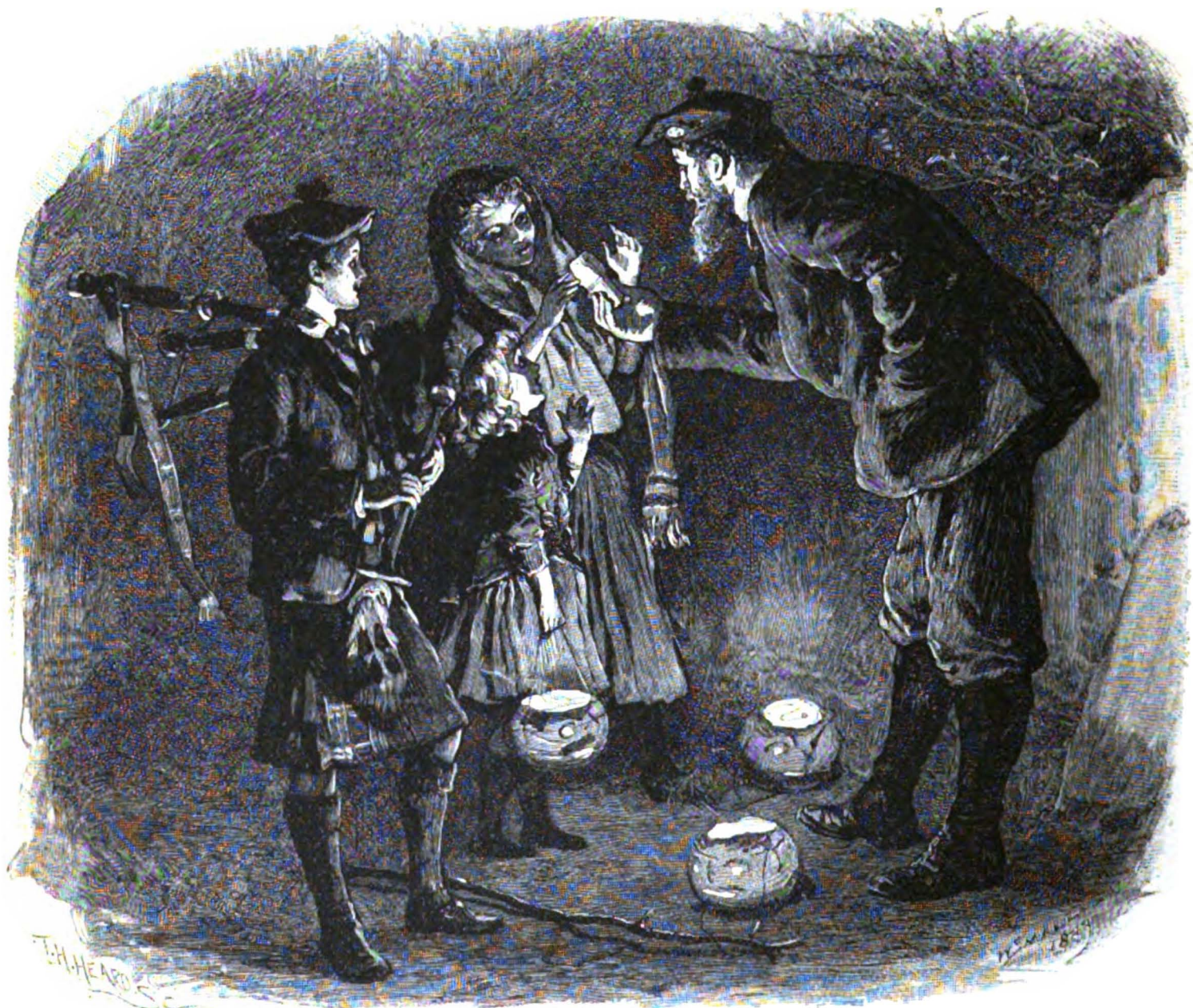
“ I WILL SEARCH MY POCKETS.”

had got near to the inn, and was about to turn down from the highway by the semi-circular drive passing the front door.