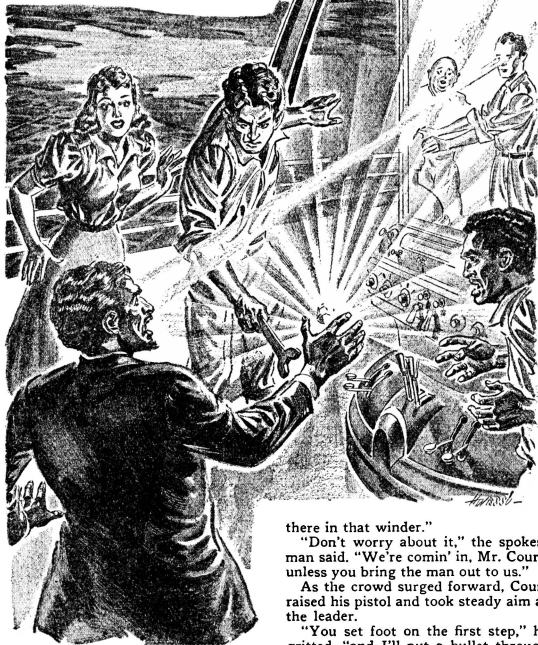
From the screen flashed a white beam that struck Thordred's eyes (Chap. XX)

"He ain't bluffing," one of the mob said nervously. "I saw a muzzle up