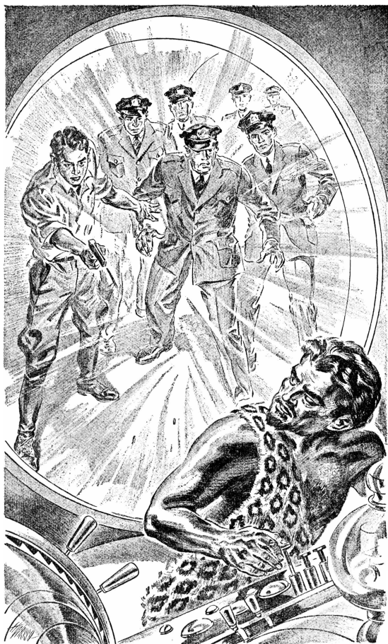
Court seized a gun, pumped bullets at the barrier of flame (Chap. XIV)