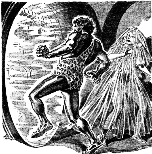
Thordred sprang savagely at the wall of flame, was flung back! (Chap. VIII)

spectators rose a roar, terrified, unbelieving.