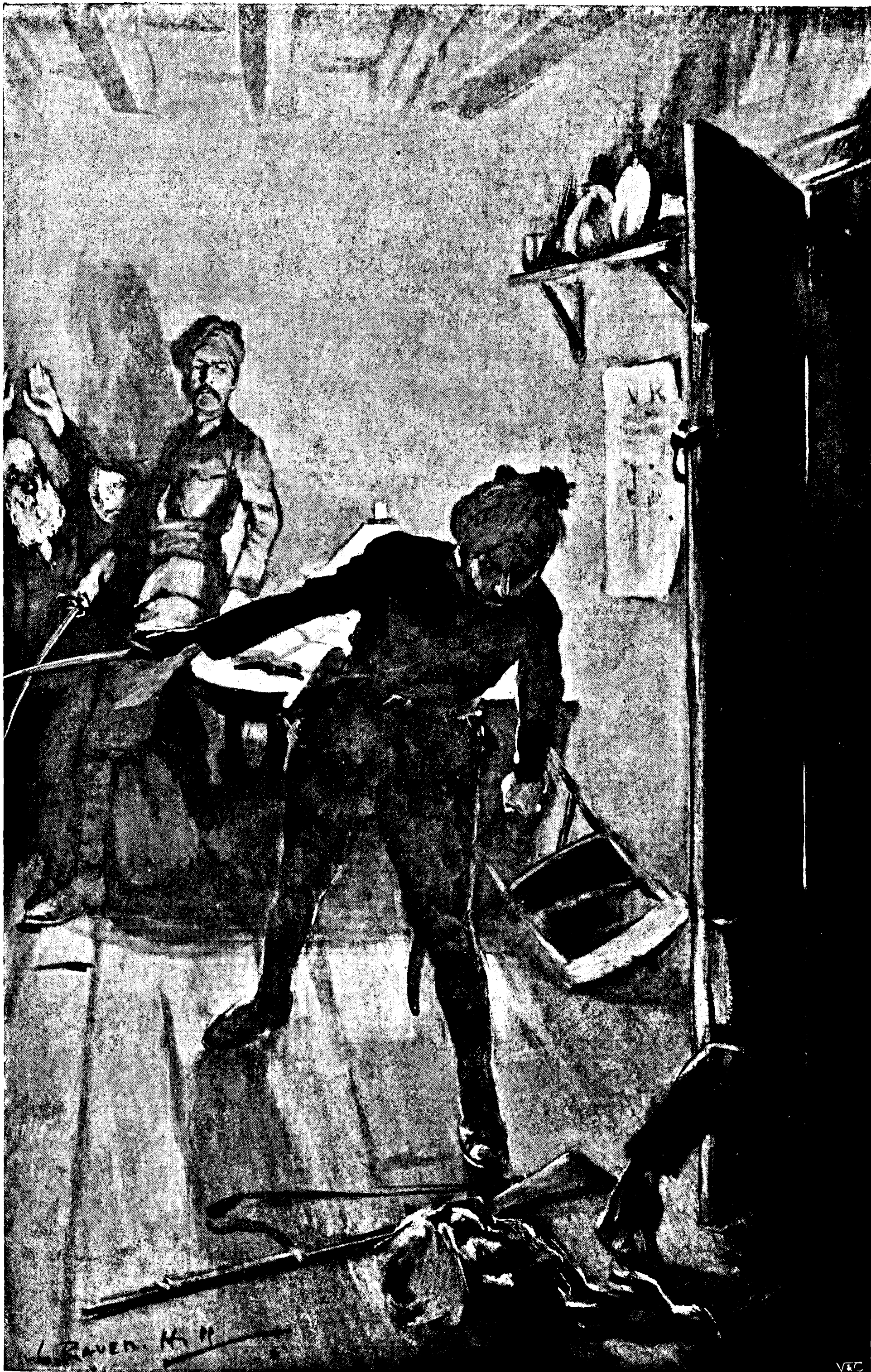
"It was a very pretty stroke."