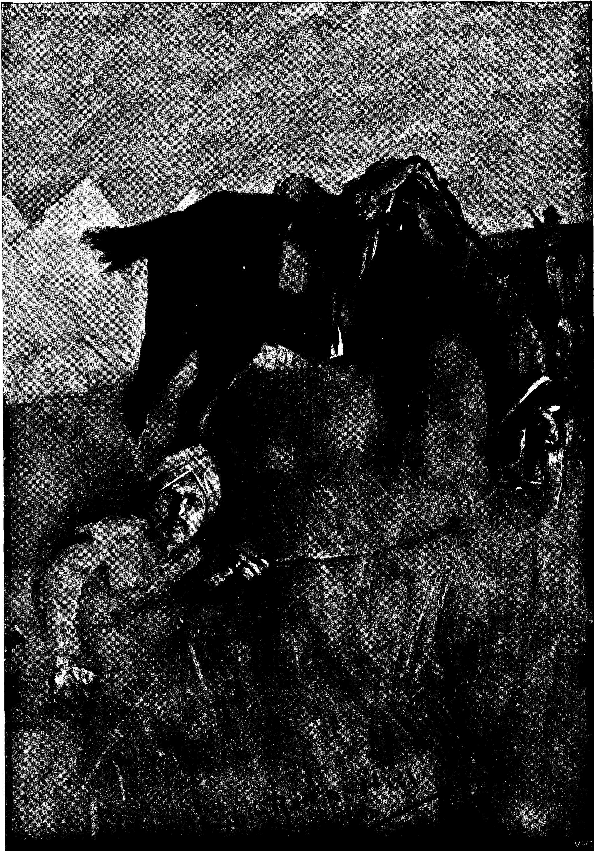
“He stole himself a horse at a place where lay a new and very raw rissala.”