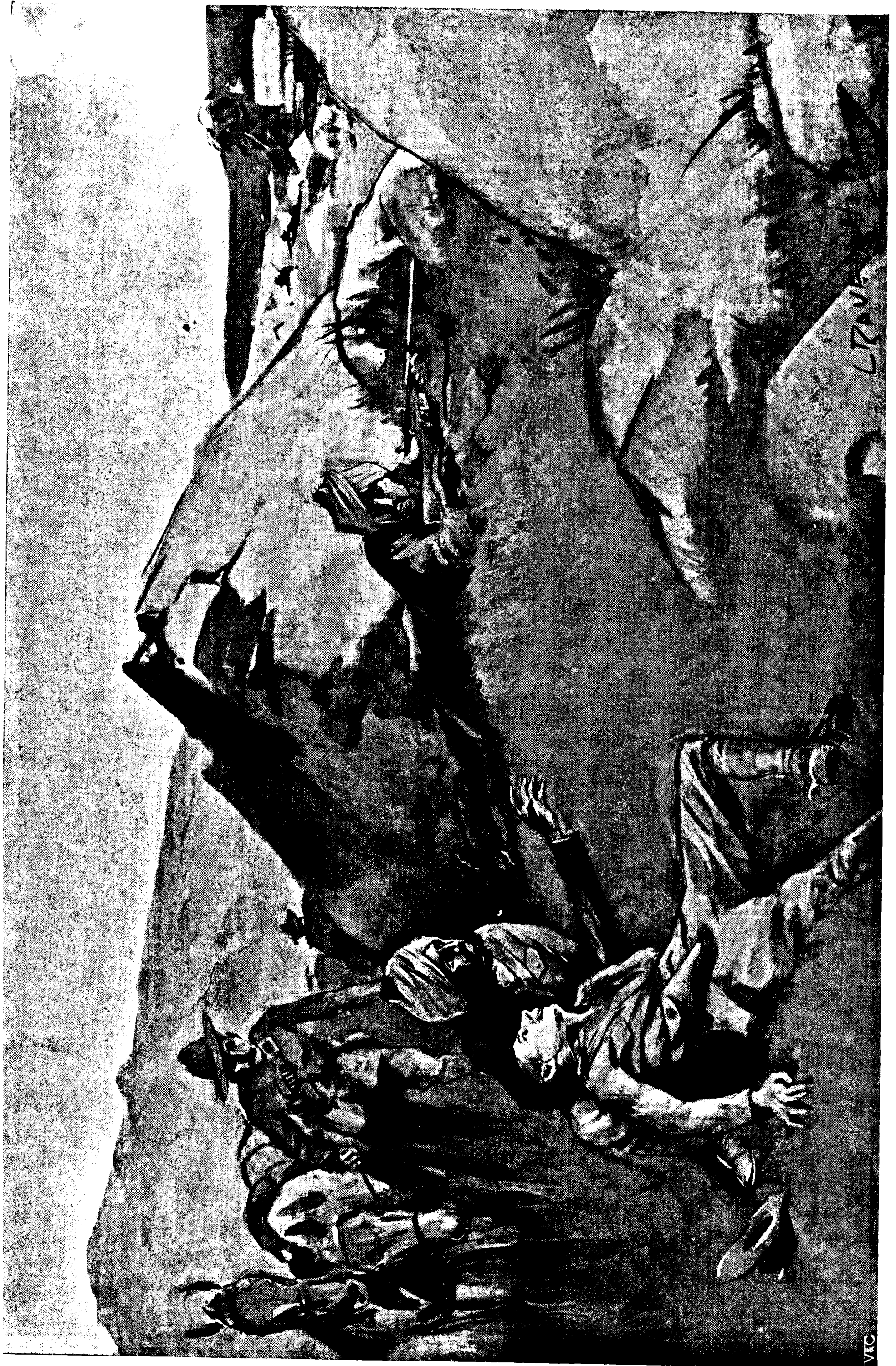
“‘Be still. It is a Sahibs’ war.’”