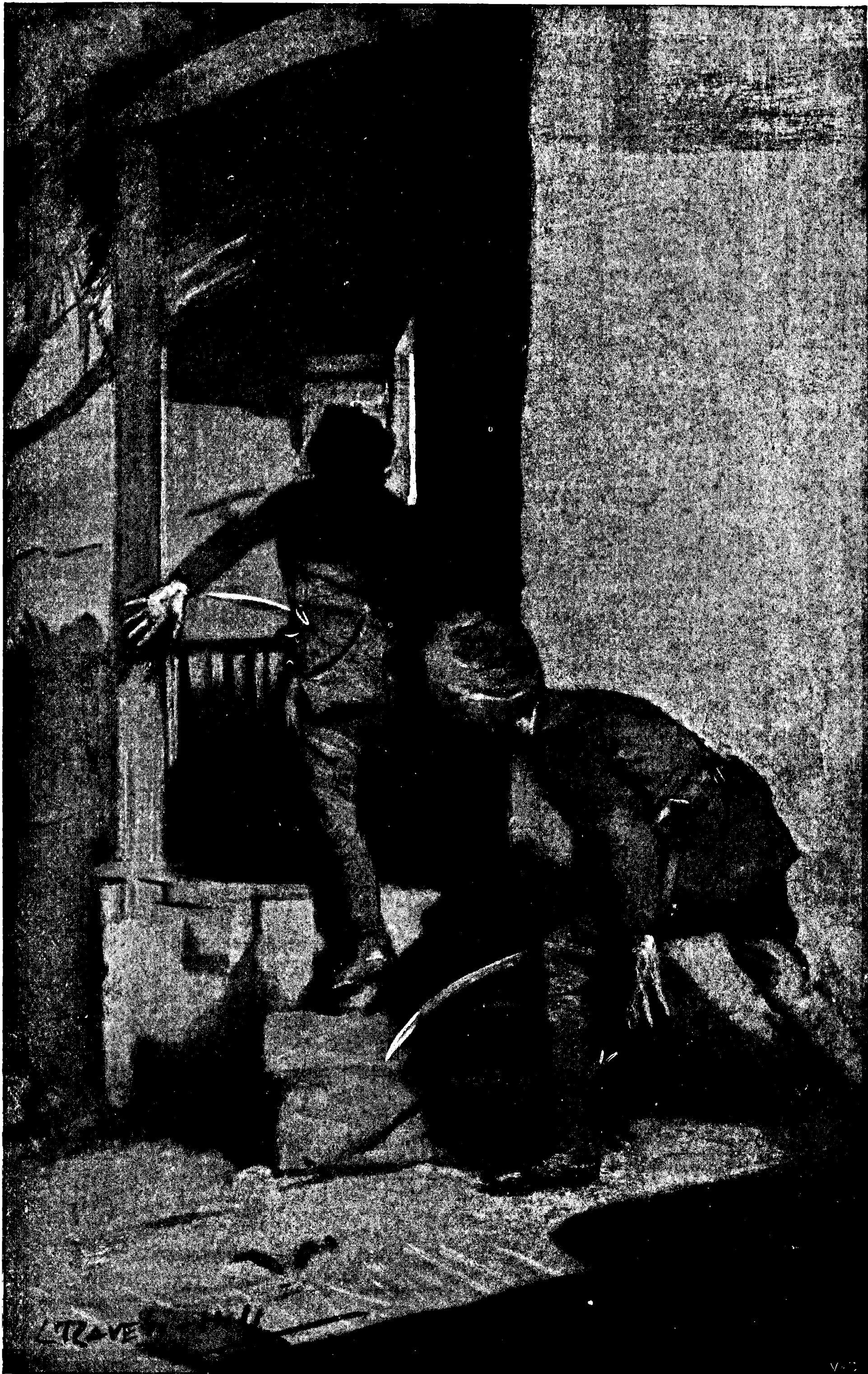
"We went down to the house and looked through the windows."