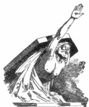
JULES VERNE'S TOMBSTONE AT AMIENS PORTRAYING HIS IMMORTALITY