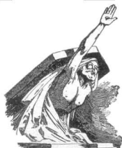
JULES VERNE'S TOMBSTONE AT AMIENS PORTRAYING HIS IMMORTALITY