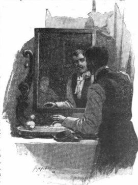
"AT THE TABLE IN THE PLACE I HAD JUST OCCUPIED I SAW A MAN WRITING"

I ran downstairs and out into the street intending to follow him. I reached the corner he had turned long before he could have arrived at the next street at the pace at which he was walking,