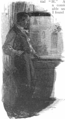
"WHAT WAS MY SURPRISE TO SEE MY STRANGE VISITOR OF THE NIGHT BEFORE."

I turned away, almost fainting. Something about the body fascinated me, however, and riveted my attention. I became convinced that I had somewhere seen the man before. Of course, the face was too disfigured for me to recognise anyone; but the figure seemed very, very familiar to me. I closely watched the policeman as he searched the clothing for marks of identification. I was about to turn from the room, when the officer discovered in a pocket in the dead man's vest a thin