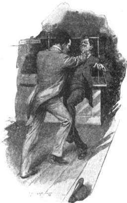
"HE SEIZED ME BY THE THROAT AND HISSED, 'YOU ARE TRYING TO CATCH ME.'"