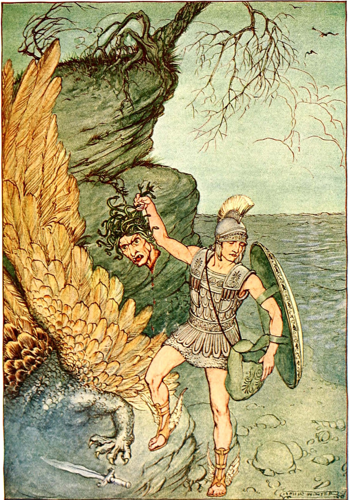
The small, embroidered wallet . . . grew all at once large enough to contain Medusa's head Page 47