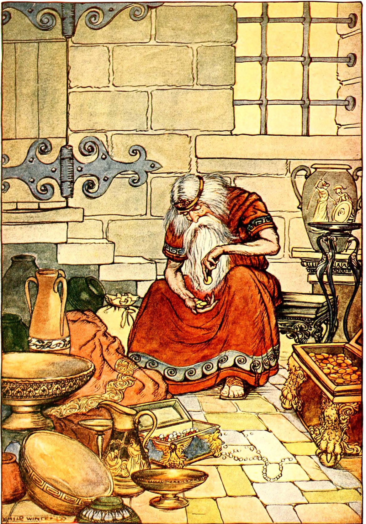
The only music for poor Midas, now, was the chink of one coin against another