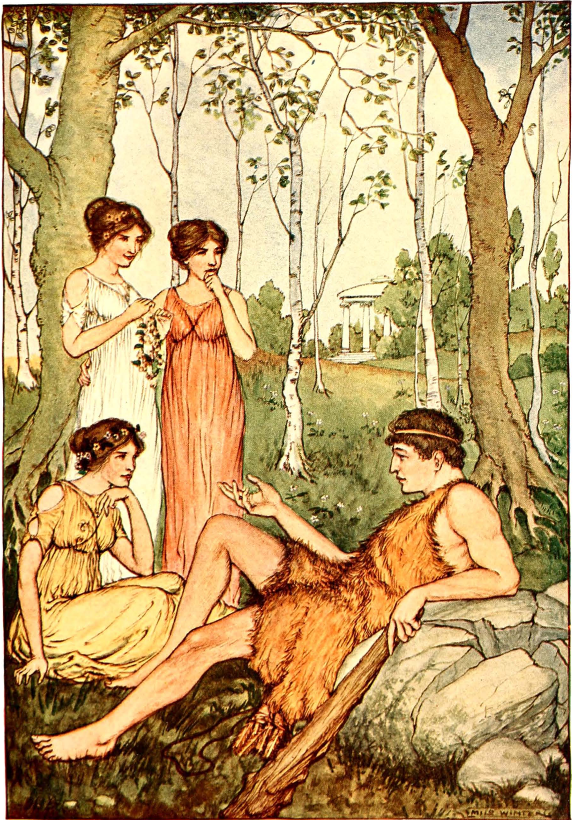
Then he sat down on the grass, and told them the story of his life