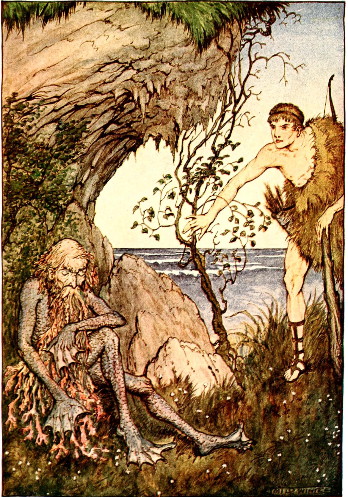
And what should Hercules espy there, but an old man fast asleep!