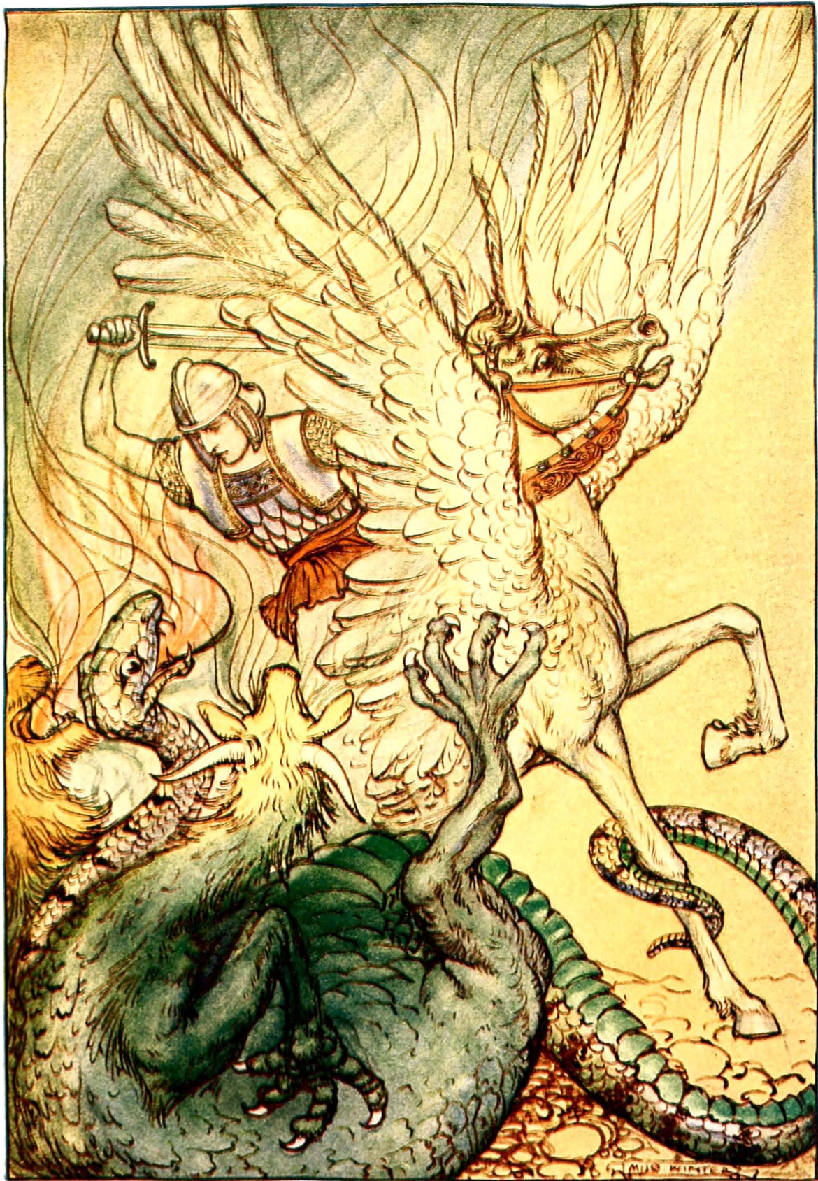
As it came within arm's-length, Bellerophon made a cut at the monster