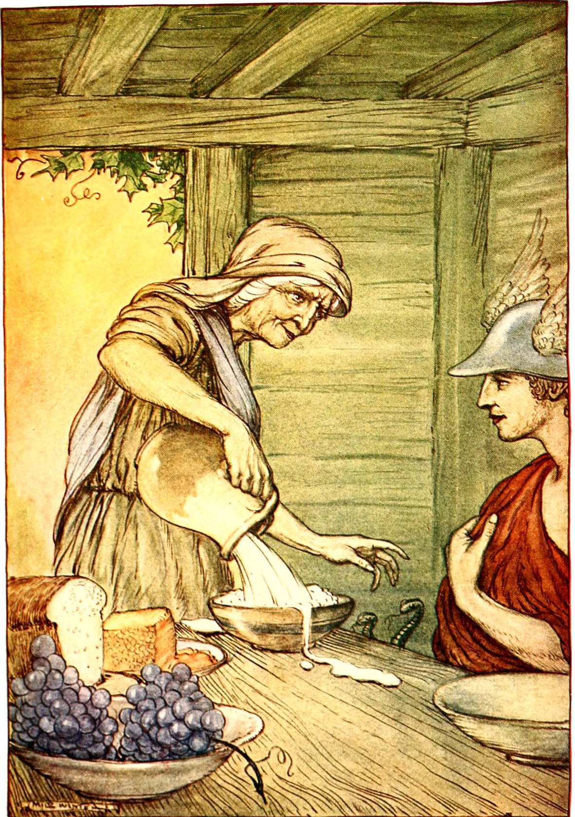
An abundant cascade fell bubbling into the bowl