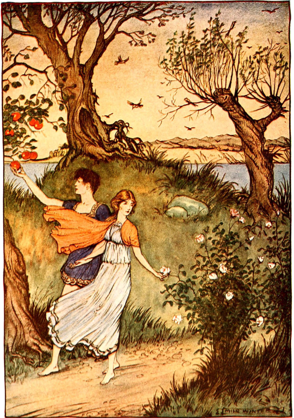
It was a very pleasant life indeed