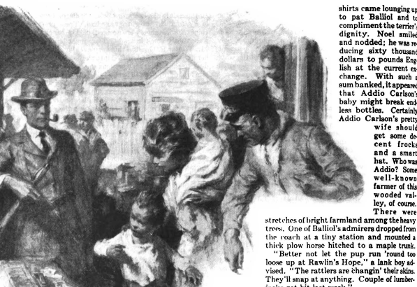
"Get Out From Under, Bud. Here's Somebody Tryin' to Get on the Train"

An informal and popular character, certainly. Her family don't go to Oil City. Ask for a ticket to North Juniper. No one announces the stations, so tell the conductor to put you off at North Juniper. Do not be discouraged by the appearance of North Juniper. Telephone me and wait at the station with the stolid courage of your