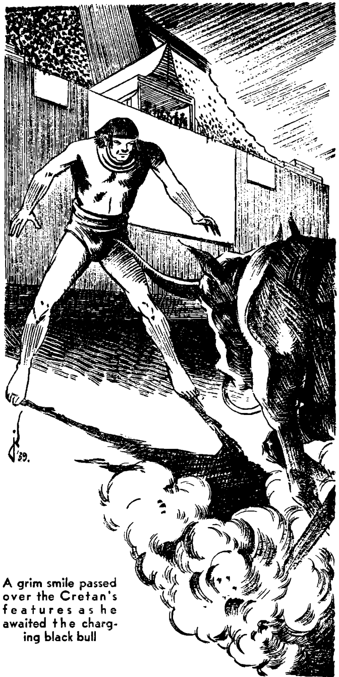
A grim smile passed over the Cretan's features as he awaited the charging black bull

A roar of approbation shook the amphitheater. Priests, alarmed by the downfall of the sacred bull, dispatched messengers to the queen's dais, demanding the life of the stranger. These Lalath waved aside as