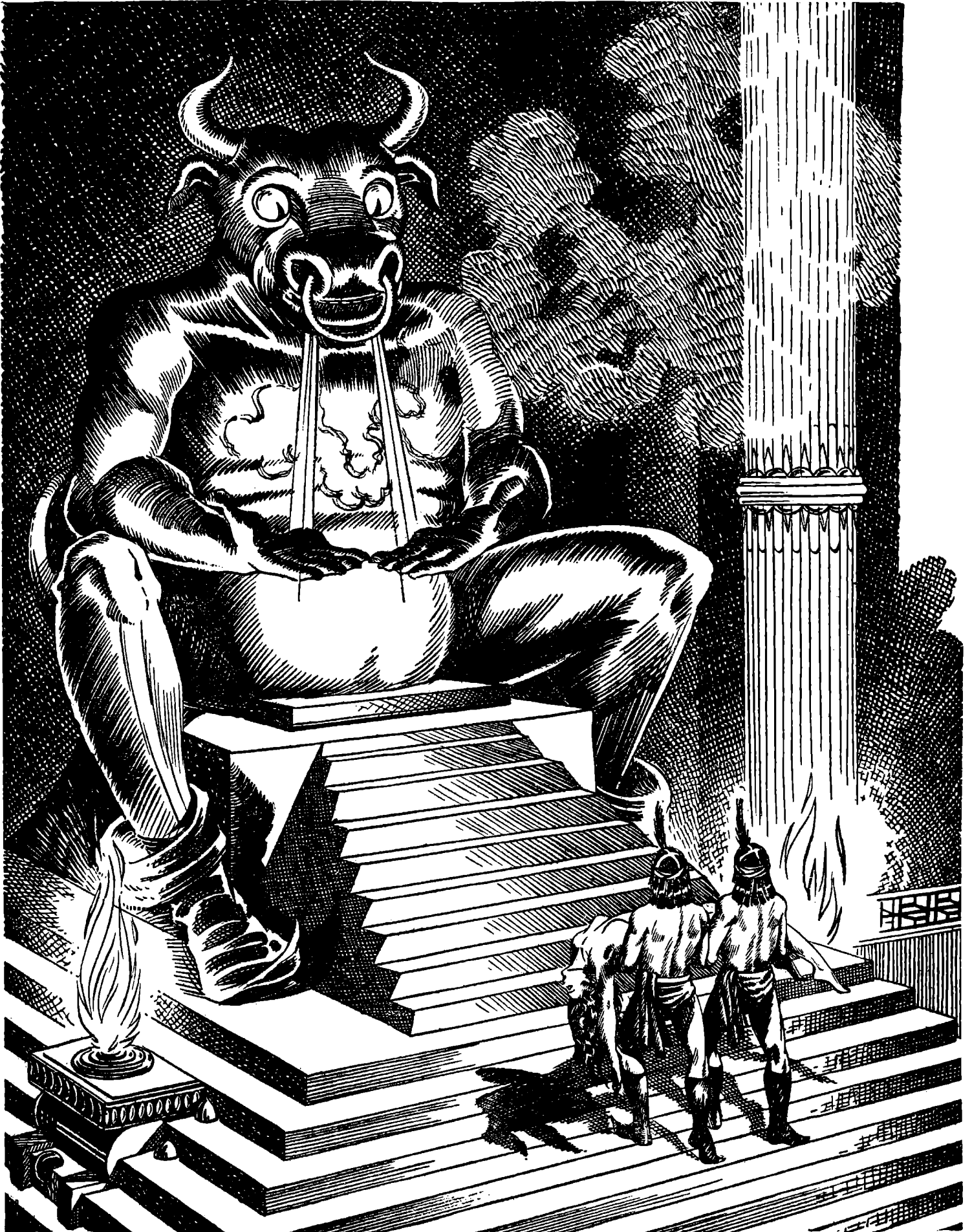
Two priests bore the girl's limp body up the pyramid stairs of the bull god