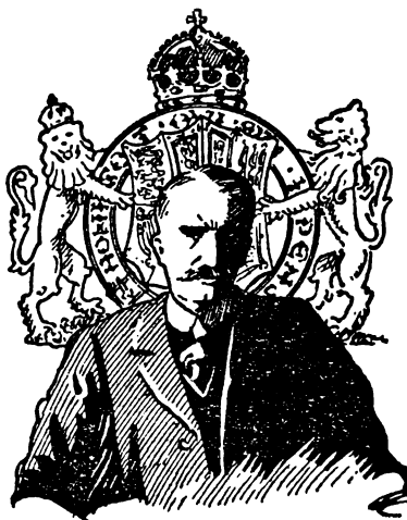
CLAUDE GEORGE BOWES-LYON PRESENT EARL OF STRATHMORE FATHER OF QUEEN ELIZABETH

THE EARL OF STRATHMORE WHO DIED IN 1905, SAID TO AN INQUIRER, "IF YOU COULD GUESS THE NATURE OF THIS SECRET, YOU WOULD GO DOWN ON YOUR KNEES AND THANK GOD IT IS NOT YOURS."