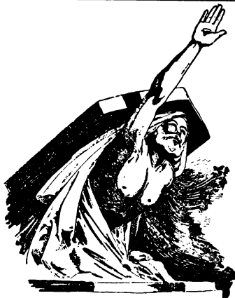
JULES VERNE'S TOMBSTONE AT AMIENS PORTRAYING HIS IMMORTALITY