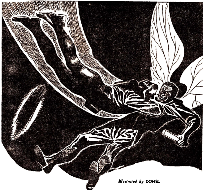
Illustrated by DONEL.