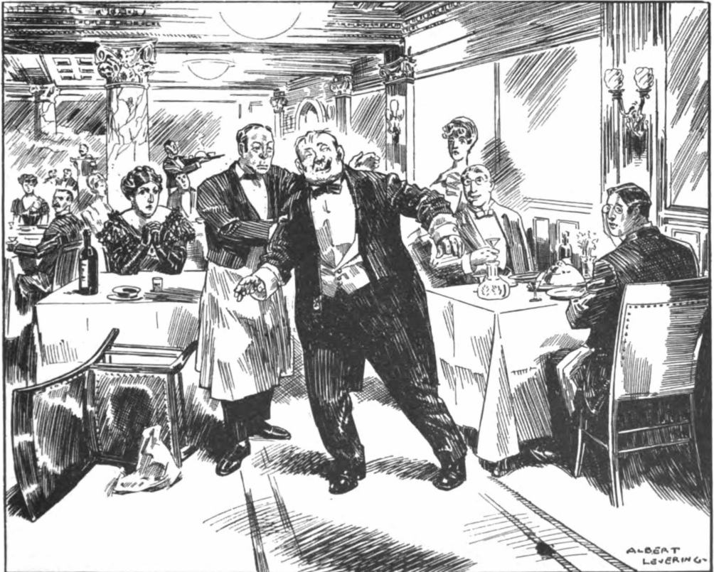
"'IF YOU PLEASE, SIR,' SAID THE WAITER, 'IF YOU WALK A FEW STEPS I CAN TELL MORE DEFINITELY.'"

My wife smiled at me reassuringly and nodded to me that what the waiter proposed had her full sanction; but even so, I was filled with a fear that we were about to be parted forever, and for a few minutes I