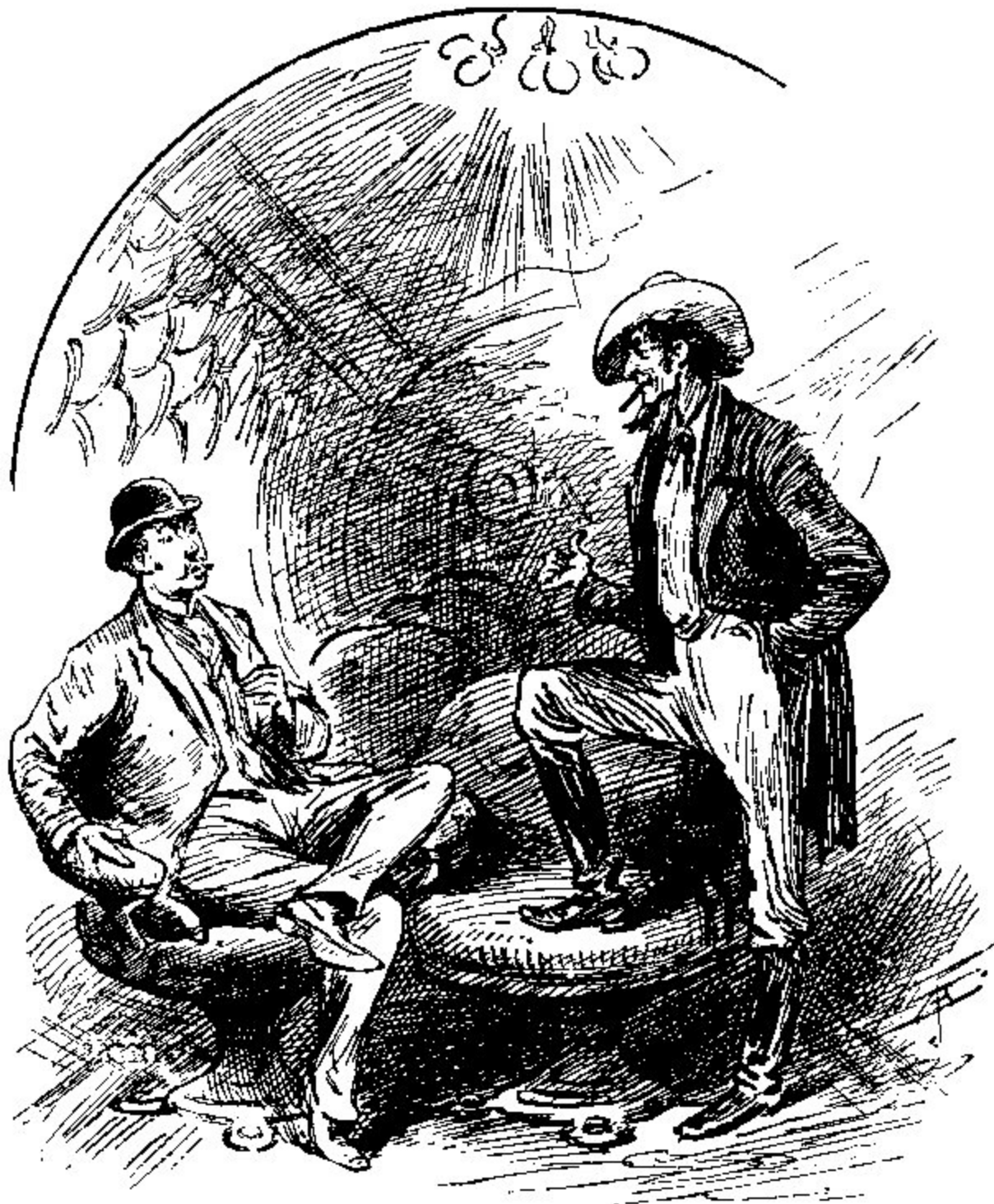
INSIDE THE CAR.

Fear seized upon me. Terrified, I tried to call out—and—and I found myself in my garden, generously sprinkled by a driving rain, the big drops of which had awakened me. I had simply fallen asleep while reading the article devoted by an American journalist to the fantastic projects of Colonel Pierce—who, also, I much fear, has only dreamed.