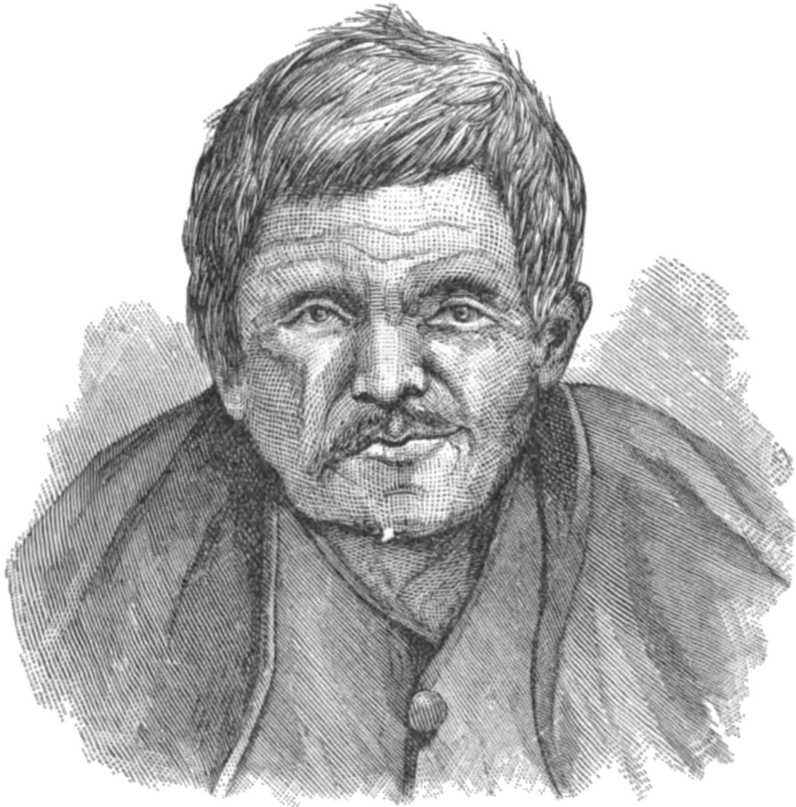
A WOLF-MAN. FROM A SKETCH MADE ON THE SPOT.

This man was evidently between twenty-five and thirty years of age, of medium