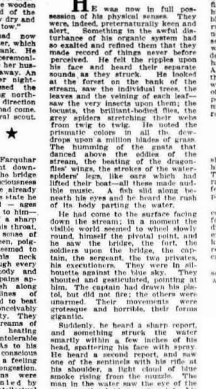
"The wood on either side was a fall of singular noises—whispers in an unknown tongue."