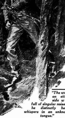
"The wood on either side was a fall of singular noises—whispers in an unknown tongue."

H E was not conscious of an effort, but a sharp pain in his wrist kept him from moving. He was not conscious of an effort, but a sharp pain in his wrist kept him from moving.