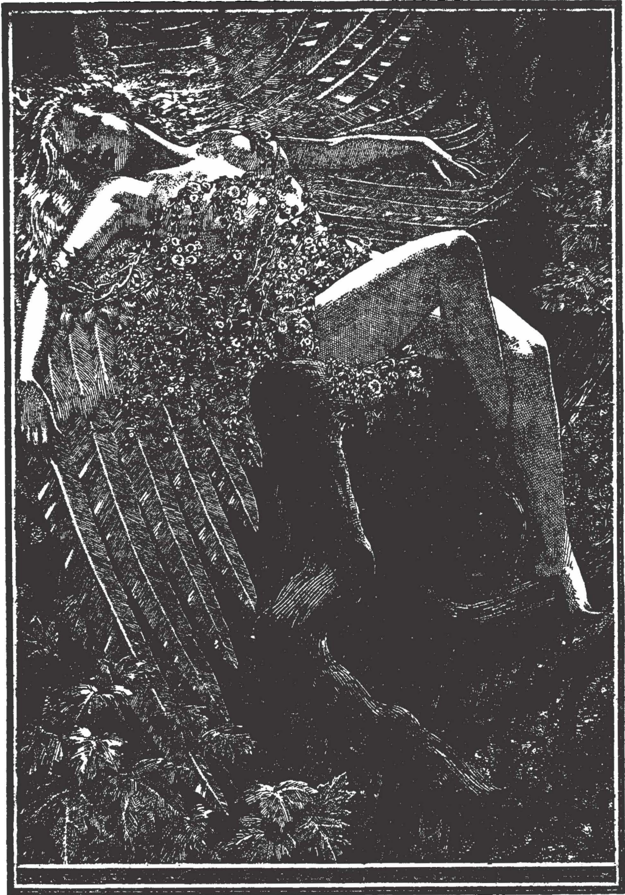
She lay there, as she had fallen, caught in one of the topmost boughs of a high tree.