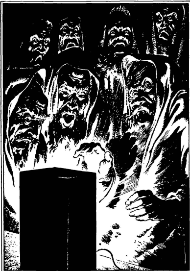
Terror struck the men of the Council.