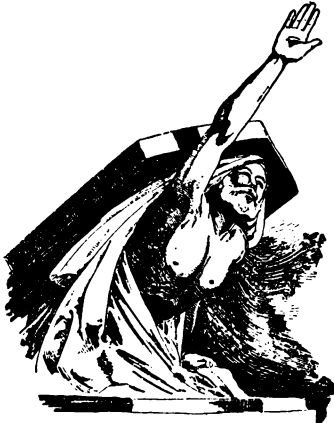
JULES VERNE'S TOMBSTONE AT AMIENS PORTRAYING HIS IMMORTALITY