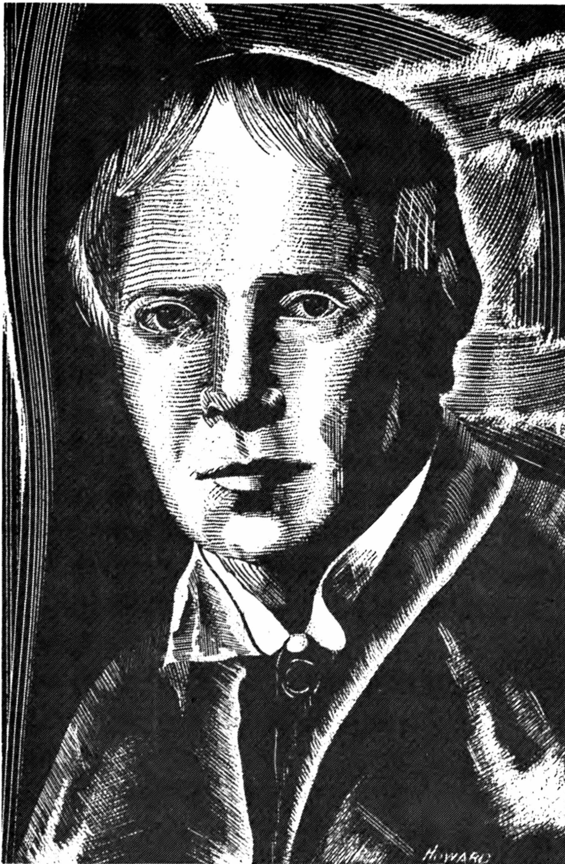
ARTHUR MACHEN After the Hoppe photograph