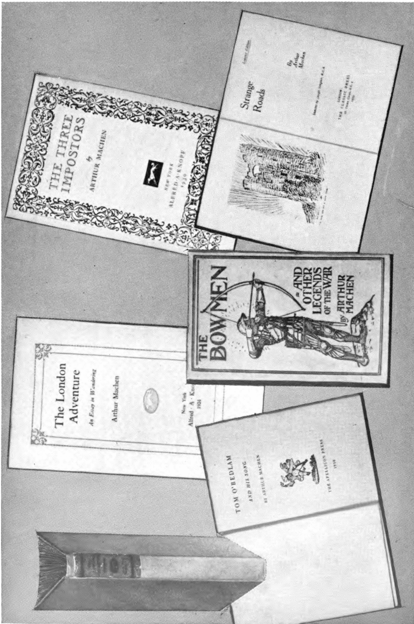
SOME MACHEN ITEMS: Showing one of the famous Knopf "Yellow Books," title pages of Knopf edition and Pocket Book, Putnam's 1915 edition of "The Bowmen" and several rare items.