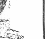
Tearing upon his shirt, I placed my ear to his breast... His heart was beating quite regularly.