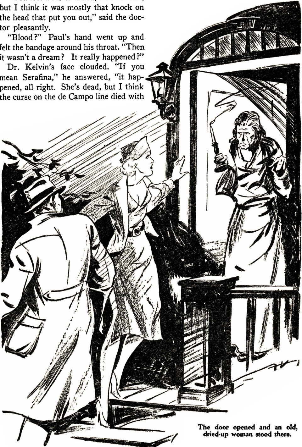
The door opened and an old, dried-up woman stood there.

her." He saw the question in Paul's eyes. "Oh, the curse was real enough too. It