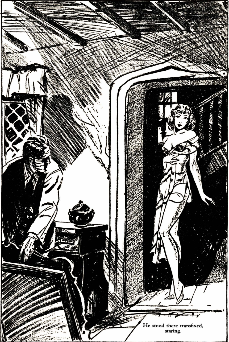
He stood there transfixed, staring.