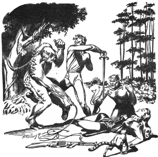
With a savage bellow Eldon leaped.

using a mental weapon against him, a lance of fear.