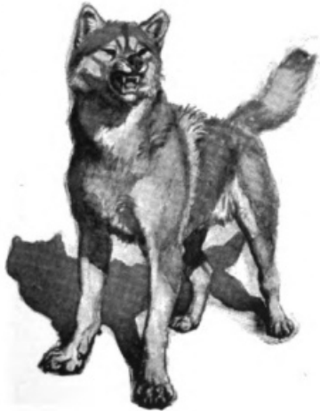
A SNARL SO TERRIBLE AND MALIGNANT THAT IT AWED THE STOUTEST OF THEM.

On the other hand, it was Madge who fed him; also it was she who ruled the kitchen, and it was by her favor, and her favor alone, that he was permitted to come within that sacred precinct. It was because of these things that