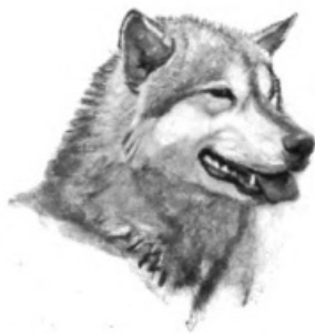
WITH OPEN MOUTH LAUGHED DOWN AT THEM.

And this would have been the end of him so far as Irvine and his wife were