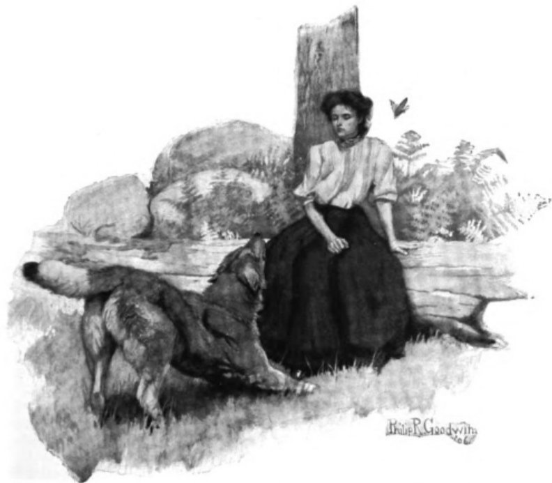
STRUGGLING WITH ALL HIS BODY TO EXPRESS THE THOUGHT THAT WAS IN HIM.

"I know the ways of women," he announced. "Their hearts is soft. When their hearts is touched they're likely to stack the cards, look at the bottom of the deck, and lie like the devil—beggin' your pardon, ma'am. I'm only discoursin' about women in general."