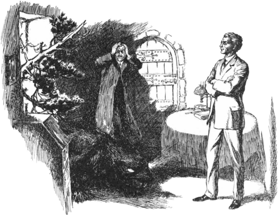
"MACBANE STOOD UPRIGHT WITH ARMS FOLDED, AND BEFORE HIM CROUCHED A BLACK MASS WITH BLOOD-RED, BURNING EYES."

Macbane stood upright with arms folded, gazing calmly forward and upward, and before him crouched, as if for a spring, a black mass with blood-red, burning eyes, the same eyes that had glared on me the night before. So much I saw; then, suddenly, the world was one blinding flame, one rending