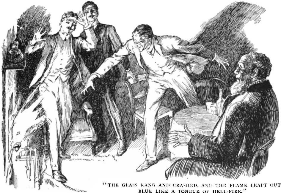
"THE GLASS RANG AND CRASHED, AND THE FLAME LEAPT OUT BLUE LIKE A TONGUE OF HELL-FIRE."

Without another word the uncle flung the door open, and shut it after him with a crash that shook the house. Then we heard him heavily stamping down the stairs and along the passage, till another great bang proclaimed that he had left the house. This last noise seemed to rouse Macbane from a sort of trance. He sprang up again and rushed to the door and threw it open, as if to pursue his uncle. We were going to stop him, for he looked murderous enough, but instead of dashing downstairs he stopped, flung out his hand with a strange gesture, as if he were pointing at something, and muttered a few words that I could not catch. Then he shut the door