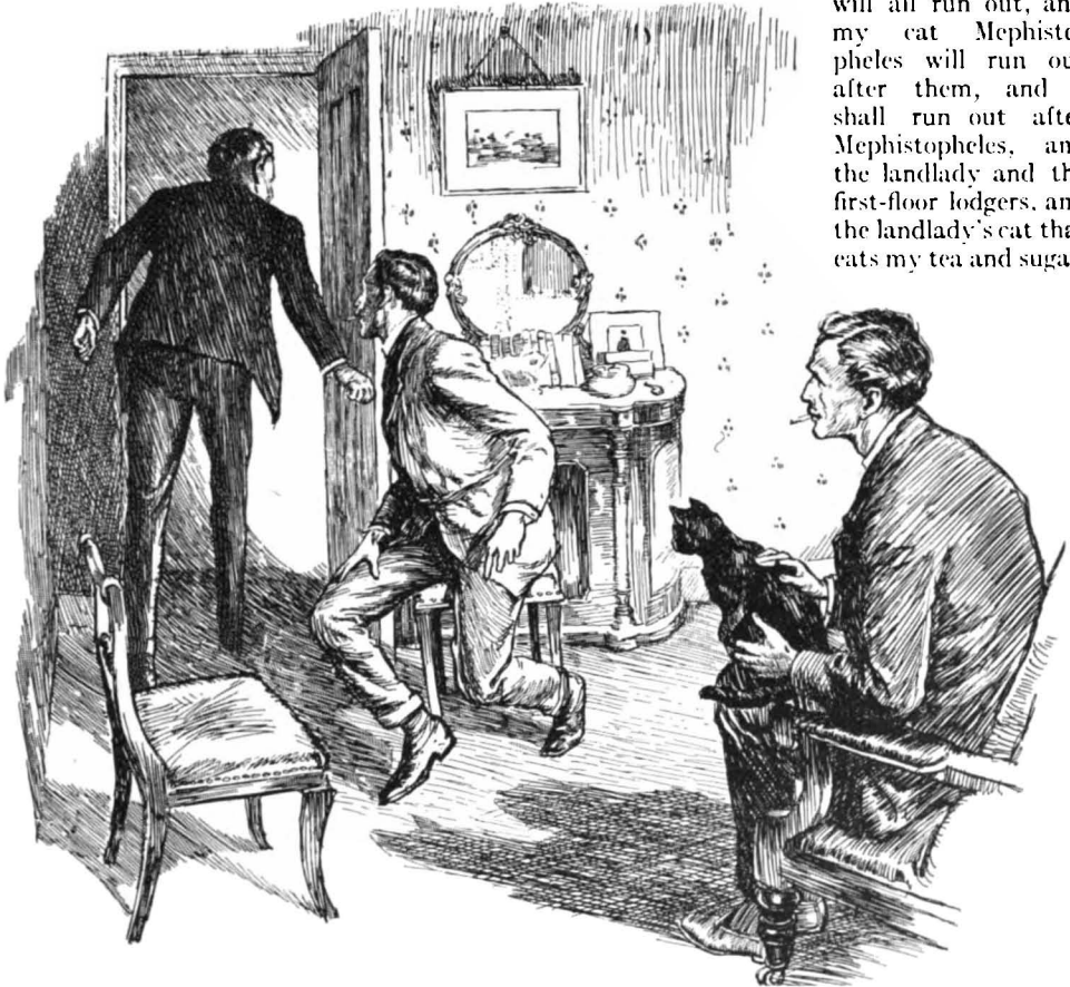
"HE FLUNG THE DOOR OPEN, AND THE CHILL AIR RUSHED IN. THERE WAS NOTHING OUTSIDE OR IN SIGHT."

going to fall the rats will all run out, and my cat Mephistopheles will run out after them, and I shall run out after Mephistopheles, and the landlady and the first-floor lodgers, and the landlady's cat that eats my tea and sugar,