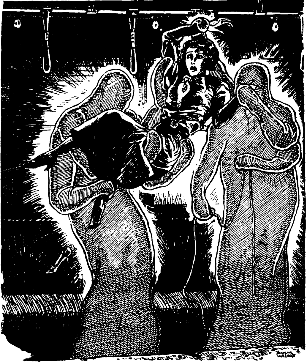
The tentacles grasped her, jerked her quivering arms up over her head

like a dark, sullen flood, in her veins.