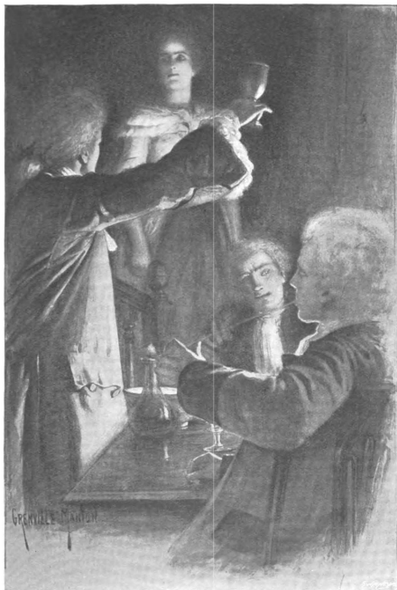
"Seeing Kate as she descended the last steps into the hall, he raised a silver cup and drank a long draught of claret. 'A la santé du Prince et de Mademoiselle.'"

his way, with his one candle, through the long black corridors, to his own room.