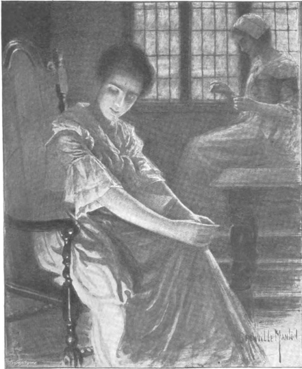
"The young lady, her hands clasped across her knees, was gazing into the fire of logs in the deep chimney-place."

"Begad, he's right," cried the old Squire: "we shall never make him out at this rate. What English he has is Scotch, and what Welsh he has is Erse,