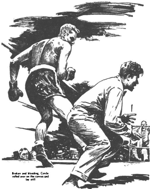
Broken and bleeding, Cande rolled over on the canvas and lay still