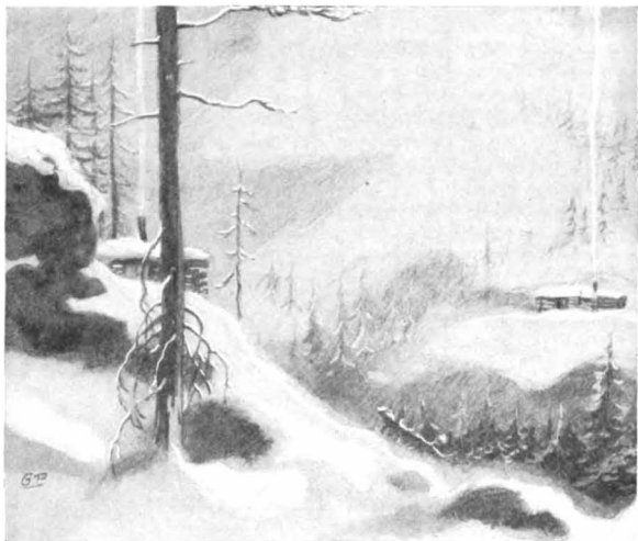
"Like two crouching enemies they face each other."