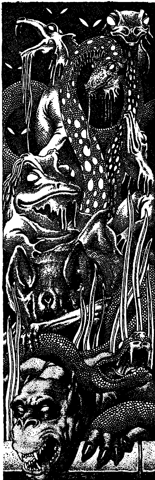
The marsh was acrawl with living forms that could only be compared to a resurgence from their graves of creatures dead and half decayed