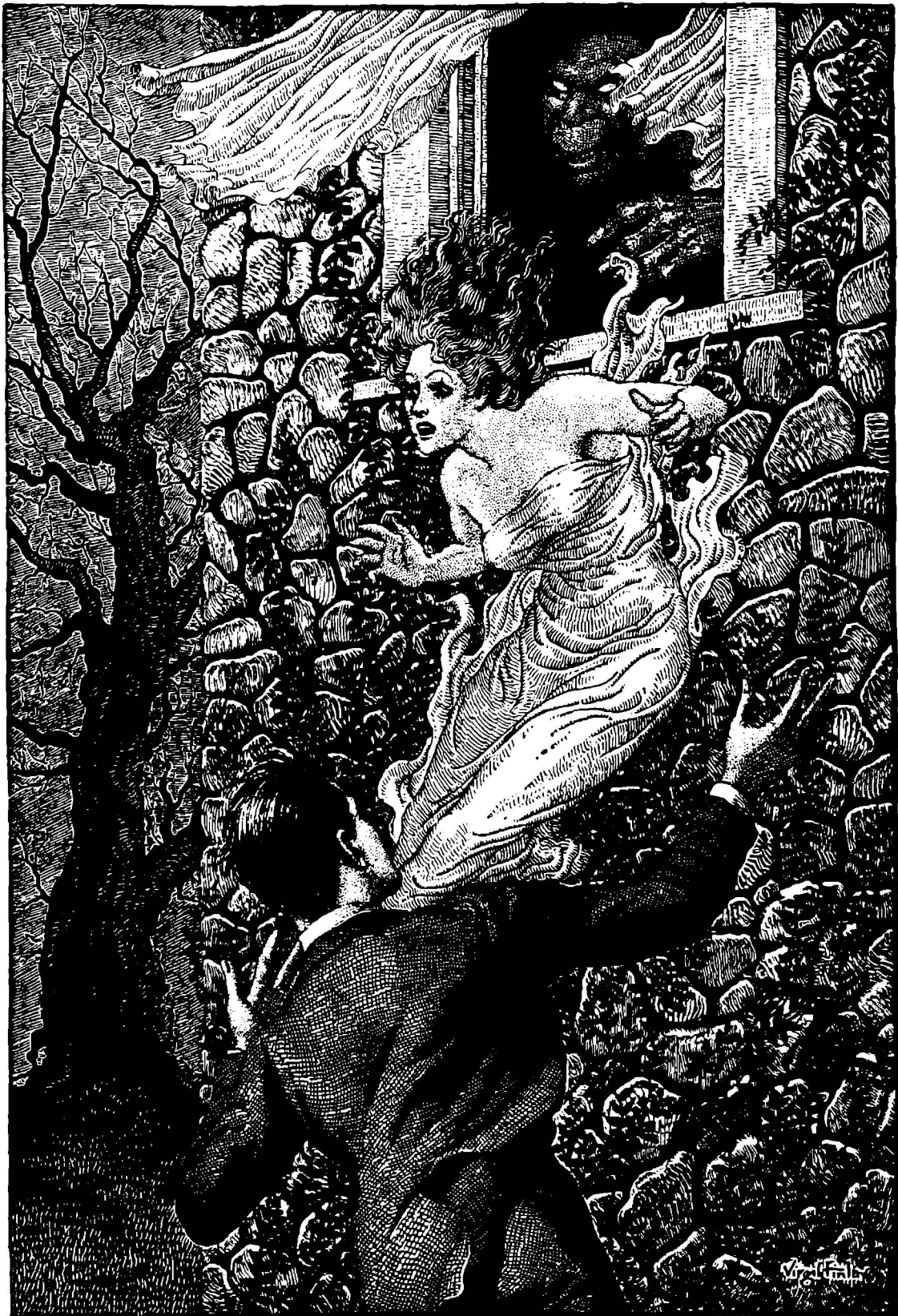
As Genghis Khan reached for her, the Dusk Lady leaped out into space with what was either amazing courage or the most terrible kind of recklessness