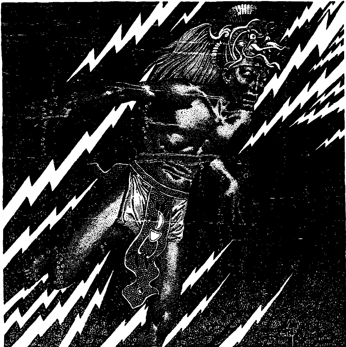
The instant his body touched the water, it was as if his skin were being lanced by a million red-hot needles. A dip in boiling oil could hardly have been more painful

so stealthily traversed, many sandaled feet were approaching.