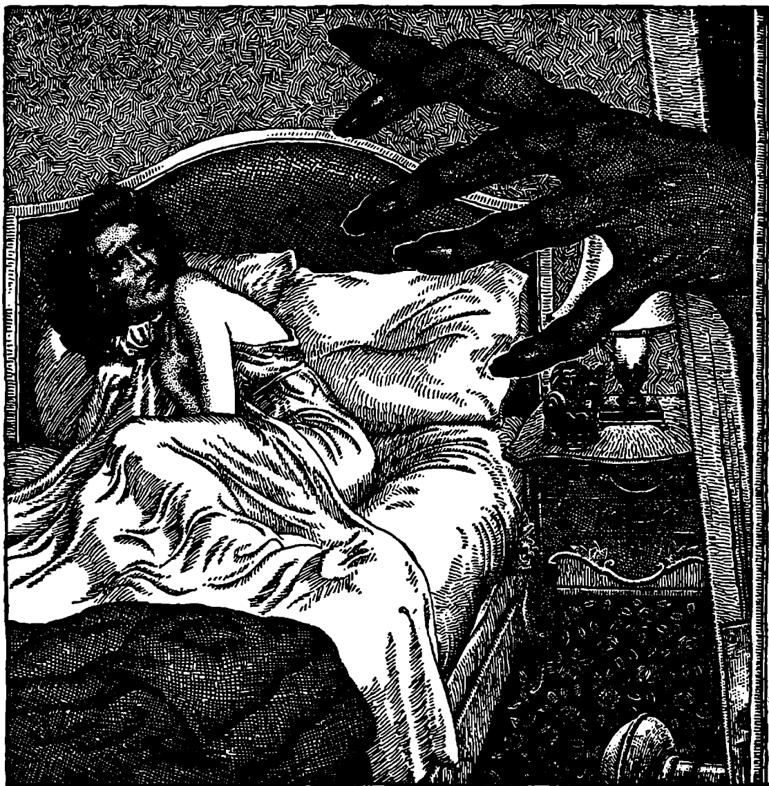
This thing of the midnight that thrashed and snarled and ripped clean through a door with its enormous claw—it had robbed her of capacity to think or reason

"Tell me the story." Cliona took the porcelain Quetzalcoatl in her hands and