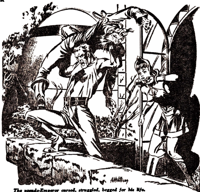
The pseudo-Emperor cursed, struggled, begged for his life.

At the coldly gleaming Experimental Station they flung this choice in Outlaw Joel Hakkyt's teeth: "Grinding, endless slavery on Asgard, that Alpha Centauri hell—or a writhing, screaming guinea-pig's death here?" He chose Asgard, naturally. But what was natural—on Asgard?