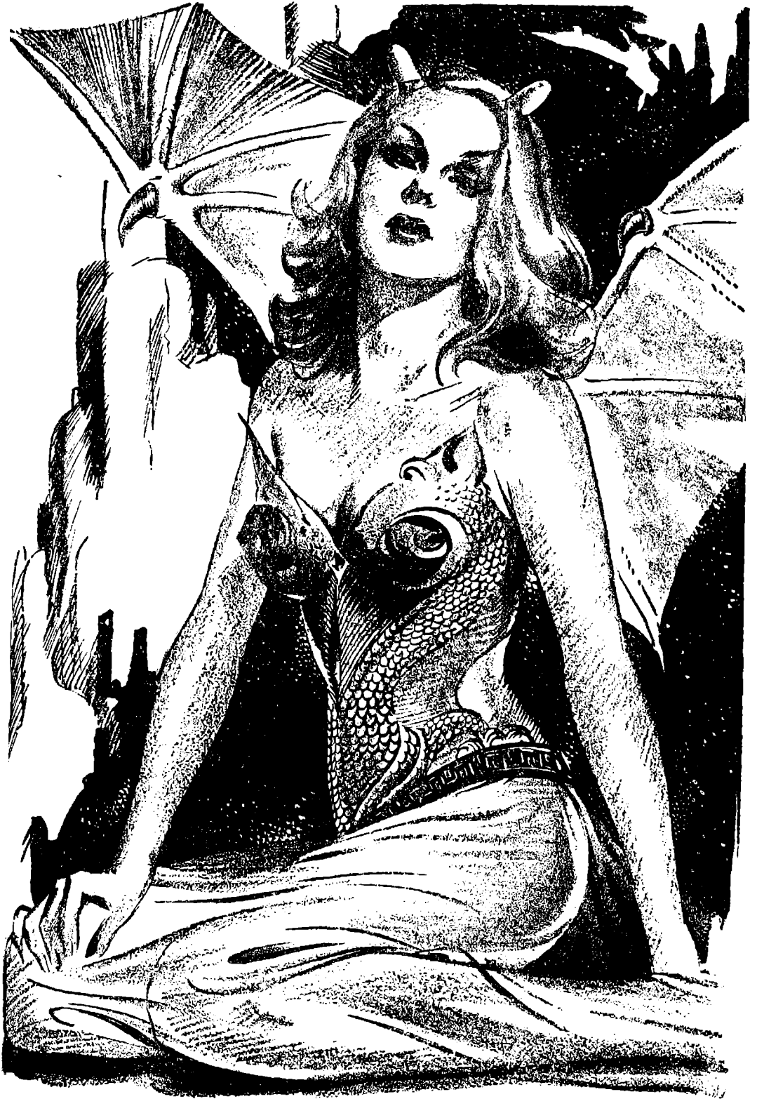
Bronson gasped aloud as the bat-like wings began slowly to spread