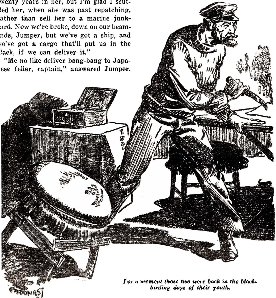
For a moment those two were back in the black-birding days of their youth.

"Don't like delivering ammunition to the Japs?" retorted M'Shane, tugging at his red beard. "Why, Jumper, you're crazy! Those Japs at Bongo Bongo are fighting Americans and Australians, not England. They're desperate for ammunition, and, unless we can run this block-