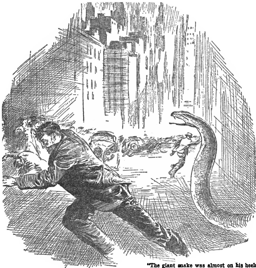
"The giant snake was almost on his heels as he reached the corner."

One of Trehearne's arms was pinned against his side by the gigantic serpent's coils. With the other he pounded, clawed and scratched at the armor-like scales of the monster.