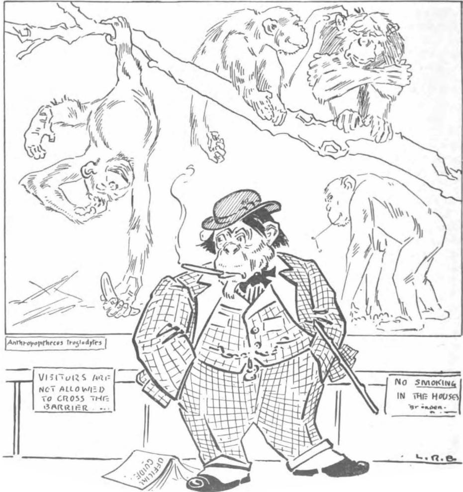
Reflections at the Zoo

port, and no coddling have made me what I am. (He stands four-foot six, and weighs nine stone.) If I hadn't used myself to all weathers I'd have caught pneumonia, like the rest of 'em! (He is the fourth of a line of Consuls.) Hullo! there goes the hash-hammer; 'fraid I must shake hands