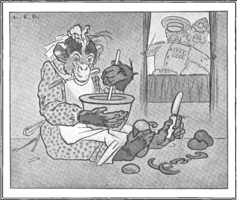
"The Servant Problem—solved at last!"