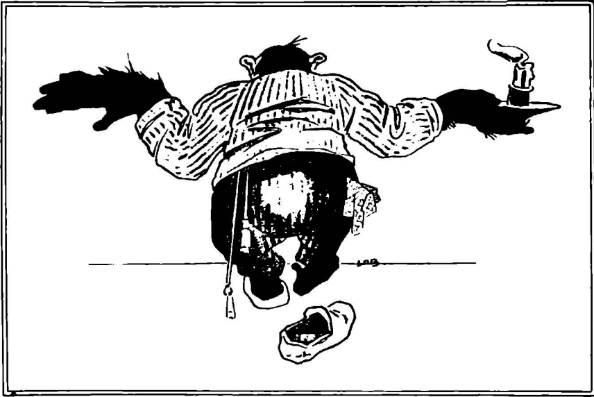
"Good-night and Good-bye."

High above all competitors, Consul is the bright side of the chimpanzee question. For it is an undeniable fact that an appallingly large and daily increasing proportion of the world's chimpanzees can now play a flash and