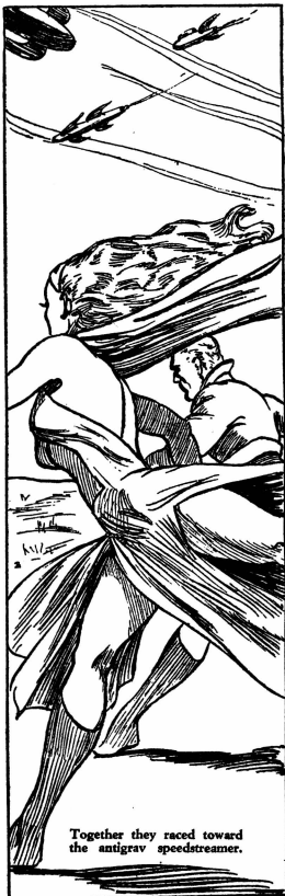
Together they raced toward the antigrav speedstreamer.