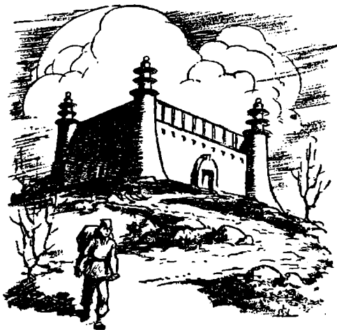
Creegar started down the rocky hill

The guards were moving back to their stations before the doors. Creegar