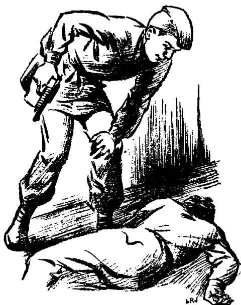
Creegar looked down at the conductor

Mouth open in choked pain; the conductor fell face forward and unconscious to the floor of the aisle. Creegar stood looking down at him for a moment, then he stepped forward and bent over the unconscious form.