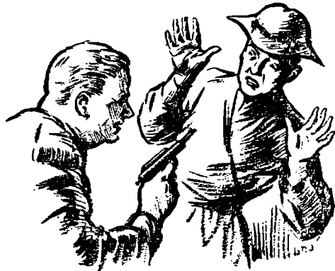
Hudge looked into the barrel of a pistol

"Don't be foolish, consular officer," he advised.