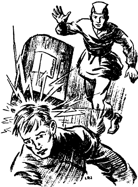
Creegar hurled the heavy box

H E was passing the desk when something inside him broke asunder, releasing the tidal wave of hate and fury and anguish that had welled behind the walls of his indomitable will for five hideous years.