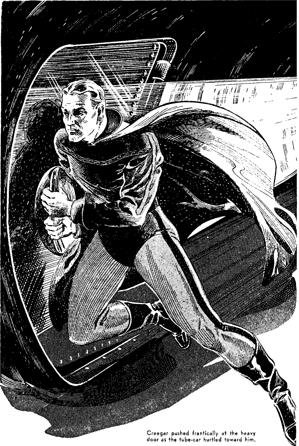
Creegar pushed frantically at the heavy door as the tube-car hurtled toward him.