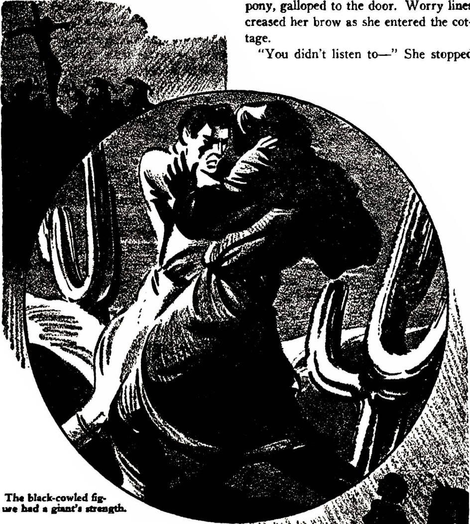
The black-cowled figure had a giant's strength.

of her flesh-perfect thighs gleamed in the flickering light of an oil lamp.