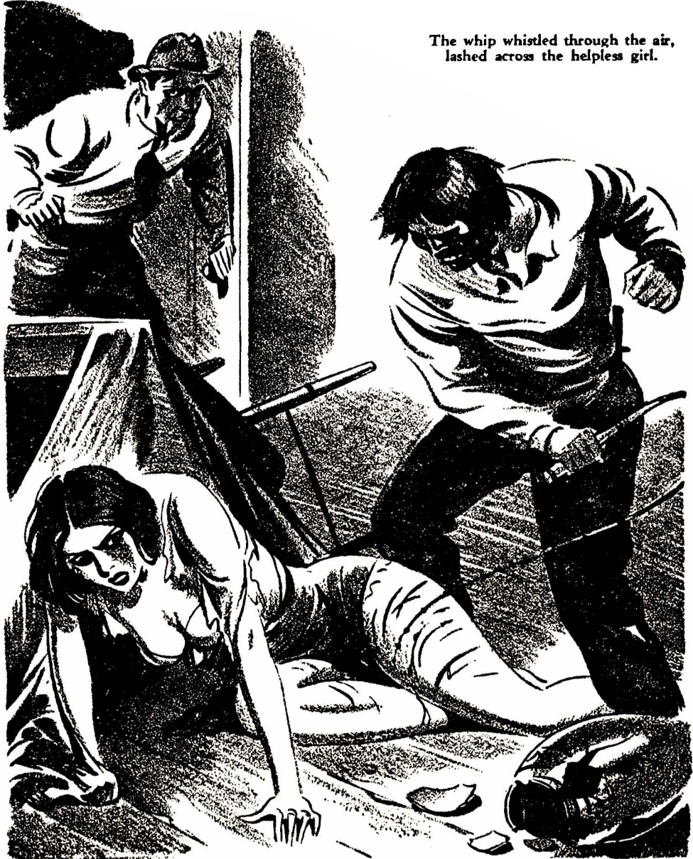
The whip whistled through the air, lashed across the helpless girl.

Before the sound of his own voice died away, Tod was conscious of an answering wail. It hung on the same high-pitched note almost indefinitely,