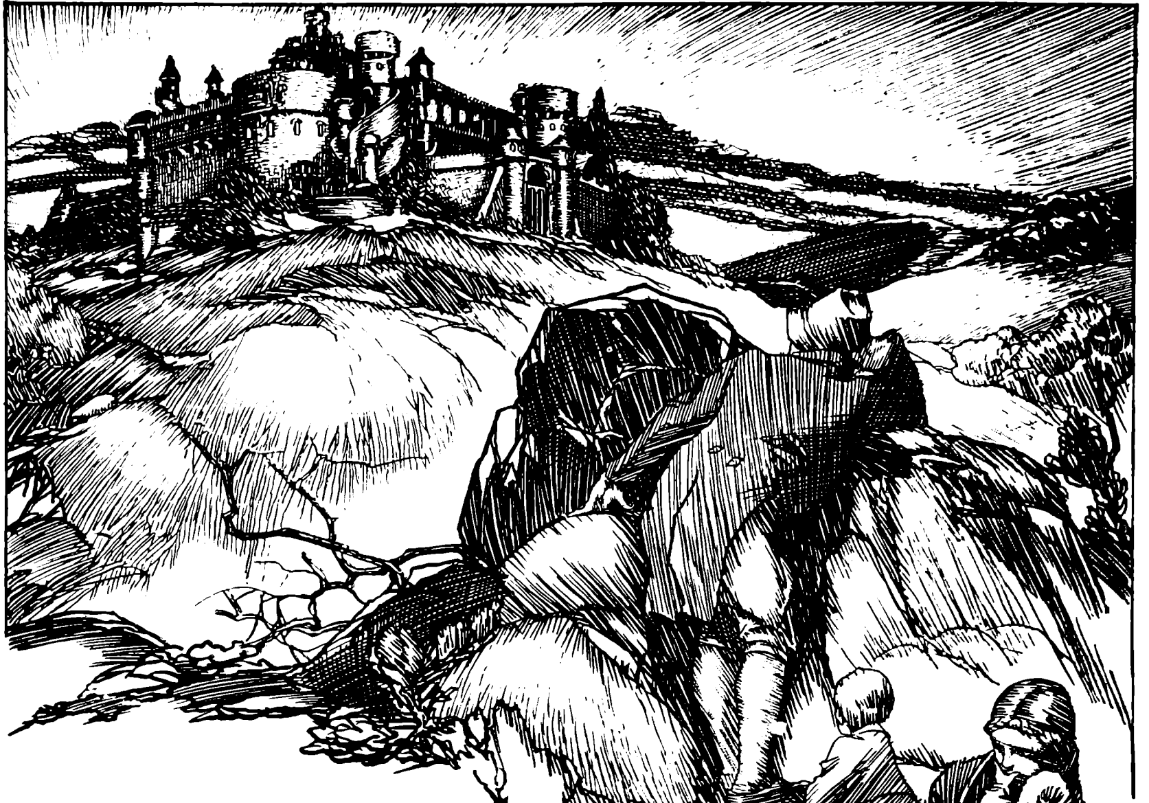
"CASTLE BROPHY COULDN'T HOULD A CANDLE TO IT."

Darby hurried on a step or two ahead an' resting his hand upon the large rock that crowns the hill, looked anxiously over to the Devil's Pillow. Although he was ready for something foine, yet the greatness of the foineness that met his gaze knocked the breath out of him.