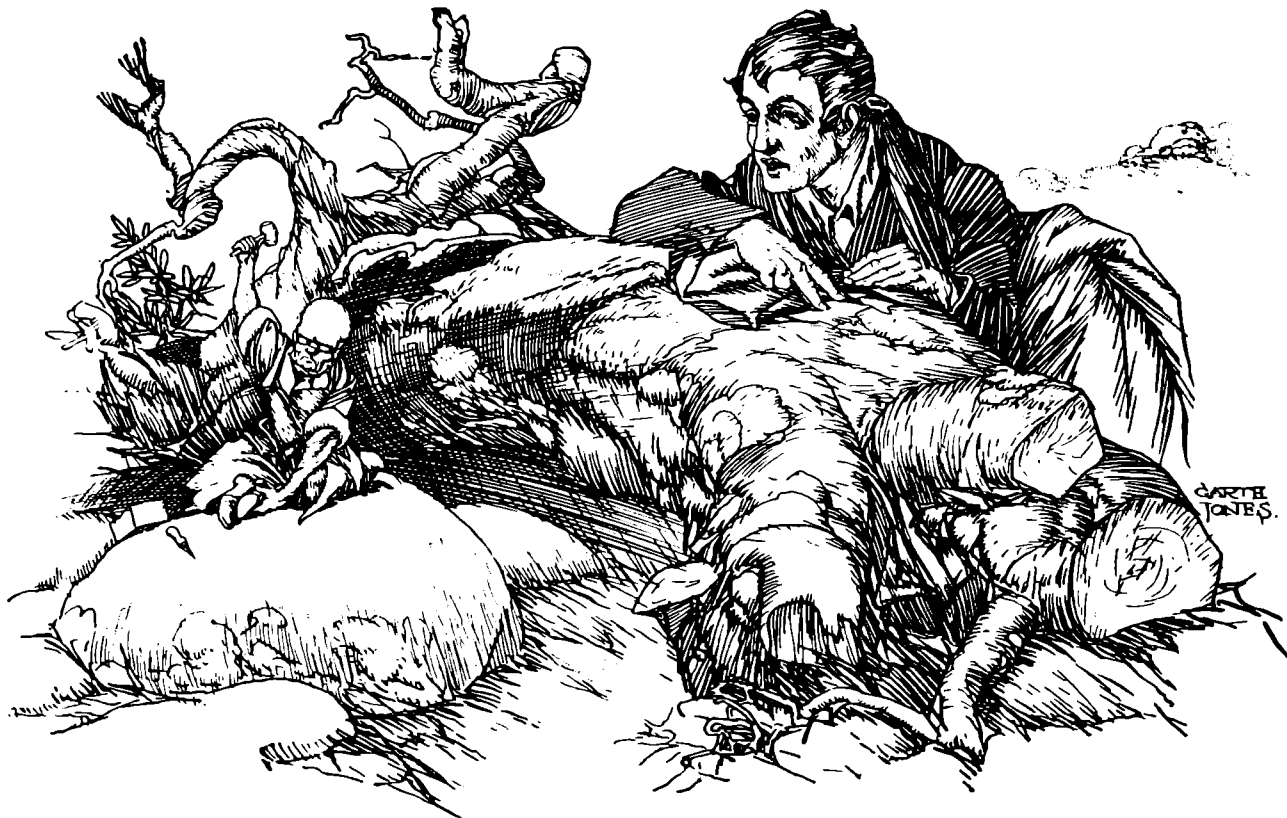
"THERE, BEFORE HIS TWO POPPING EYES, WAS A SIGHT OF WONDERHATION."

as Darby O'Gill, surrendered and granted the favours of the three wishes.