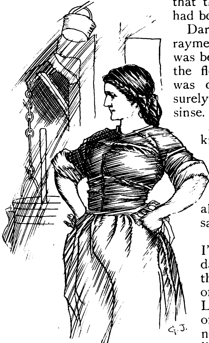
"THEN SHE BEGAN AN' TALKED STEADY AS A FALL OF HAIL"

"If I were rich," says Darby to a lazy ould bumble bee who was droning an' tumbling in front of him, "I'd have a castle like Castle Brophy, with a great picture gallery in it. On one wall I'd