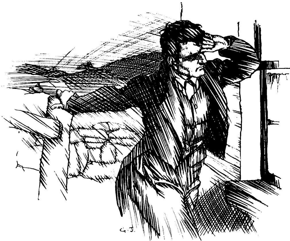
"HIS HEART STOOD STILL AS HE PEEPED THROUGH THE WINDOW

Tears of gladness crept into Darby's eyes as he looked in upon her. "God bless her," he says to himself. "She's the flower of the O'Hagans and the