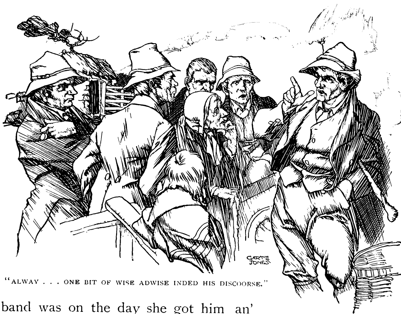
"ALWAY . . . ONE BIT OF WISE ADVISE INDED HIS DISCOORSE."

Bridget stood on the step looking after him too surprised for a word. With his fingers still in his ears, so that he couldn't hear her commands to turn back, he ran without stopping till he came to the willow tree near Micky Doolan's forge. There he slowed down to fill his lungs with the fresh, sweet air.