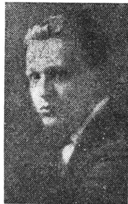
Stanley G. Weinbaum

The story of The Black Flame and the City of Urbs we have already published in our companion magazine, STARTLING STORIES , where it achieved immediate acclaim. And now we are privileged to present DAWN OF FLAME , a story that will be as immortal as its author.—THE EDITOR.