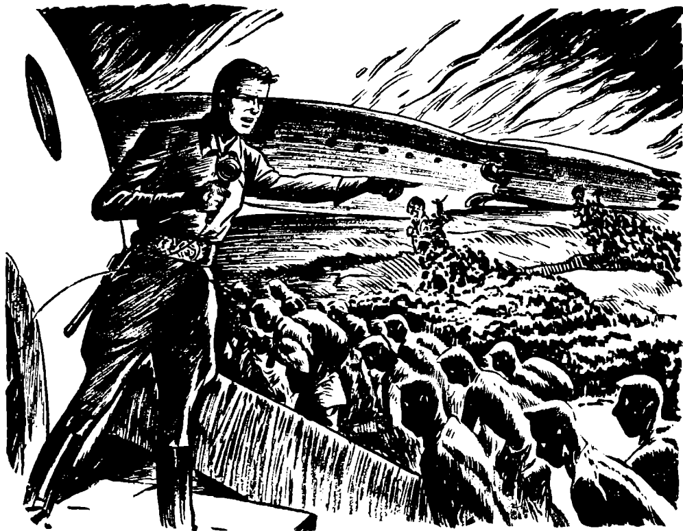
The evacuation was successful.