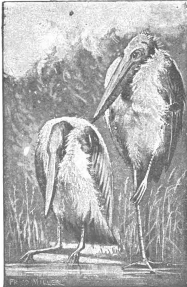
SPENLOW AND JORKINS.

the rest the surgeon tells me that the leaden weight was not too firmly fixed, and that seven days bring about changes which are wont to fetch a body to the surface. Coming from the depth which the weight would have sunk it to, he explains that it might well attain such a velocity as to carry it clear of the water. Such is my own explanation of the matter, and if you ask me what then became of the body, I must recall to you that snapping, crackling sound, with the swirl in the water. The shark is a surface feeder and is plentiful in those parts.