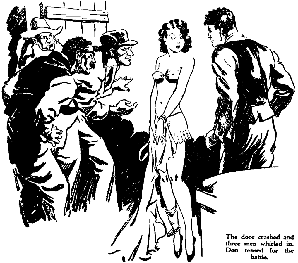
The door crashed and three men whirled in. Don tensed for the battle.

shifted his cramped limbs and sat up again, leaning against a bulwark. He looked at the two Mounties. They had the faces of gangsters, rather than of policemen.