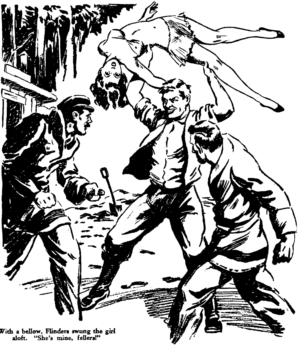
With a bellow, Flinders swung the girl aloft. "She's mine, fellers!"

rocks beside the river, worth many thousands of dollars. Tom had waved from the doorway. "See you in the Spring," he called.