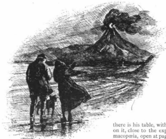
"SHE POINTED OUT A REDDISH LIGHT."