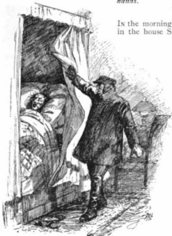
"DR. TRIFULGAS SEIZES THE CURTAINS."

on the map. The best geographers have not yet agreed as to its latitude—nor even as to its longitude.