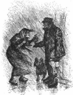
"HERE IS THE MONEY."

The dog had drawn near to his master, and seemed to say to him, "Come, come! a hundred and twenty fretzers for the strong box! That is the way to make a fortune. Another rood added to the vineyard; another dish added to our supper; another meat pie for the faithful Hurzof.