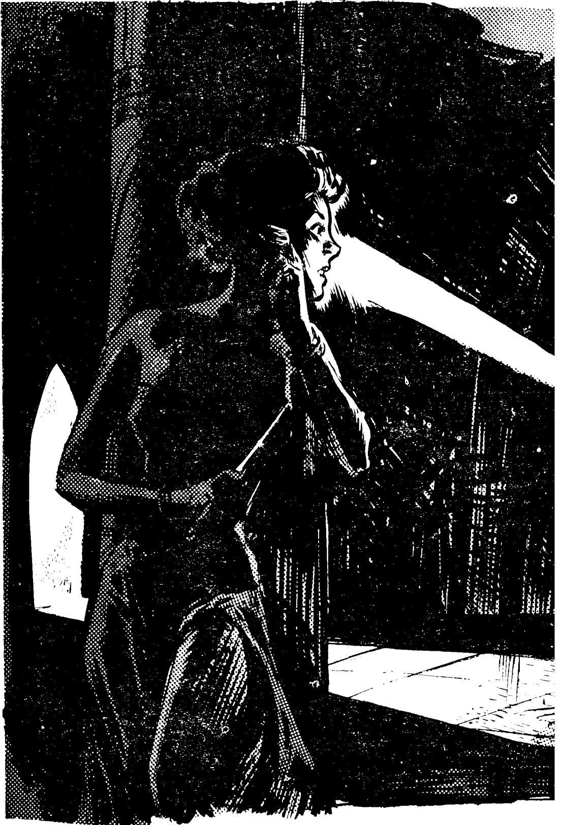
A shadow moved behind a pillar, and Cap's flash sent a quick beam of light toward it.