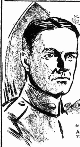
BRIGADIER GENERAL WILLIAM MITCHELL DURING THE WORLD WAR WAS CALLED "THE FLYING GENERAL" AND WAS THE ONLY AMERICAN GENERAL TO MAKE FLIGHTS OVER THE GERMAN LINES AND BATTLE THE BOCHE.