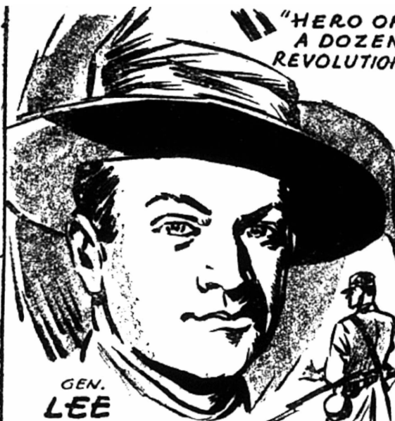
GEN. LEE CHRISTMAS

THE LOUISIANA RAILROAD ENGINEER WHO BECAME KNOWN AS THE "GREAT FIGHTING ADVENTURER."