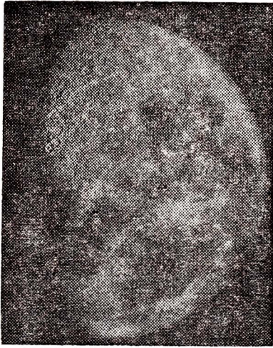
TARGET NO. 1