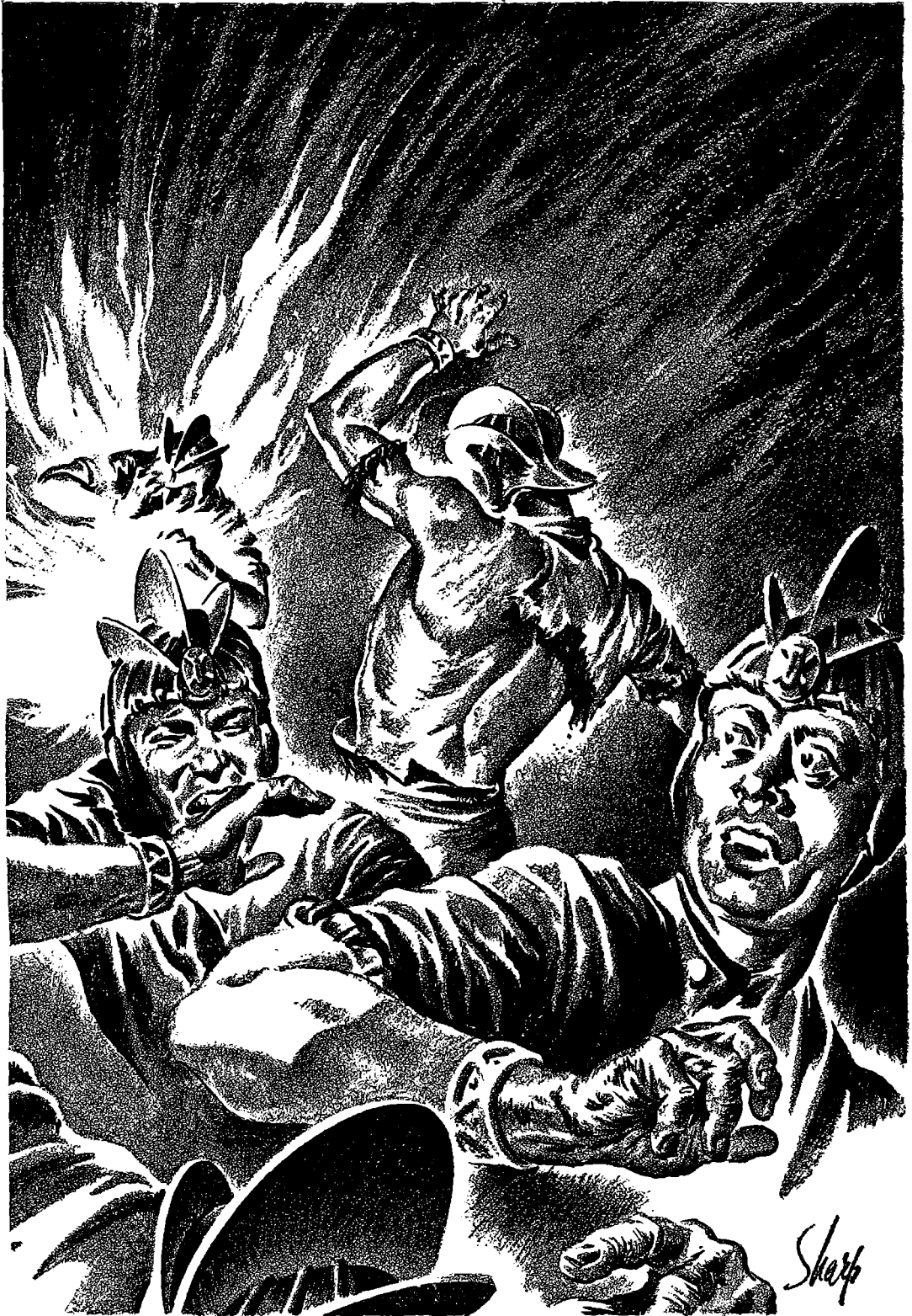
The gun blasted a stream of fire and death, and cries of pain filled the air . . .