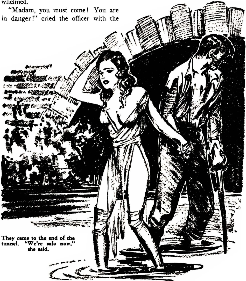
They came to the end of the tunnel. "We're safe now," she said.