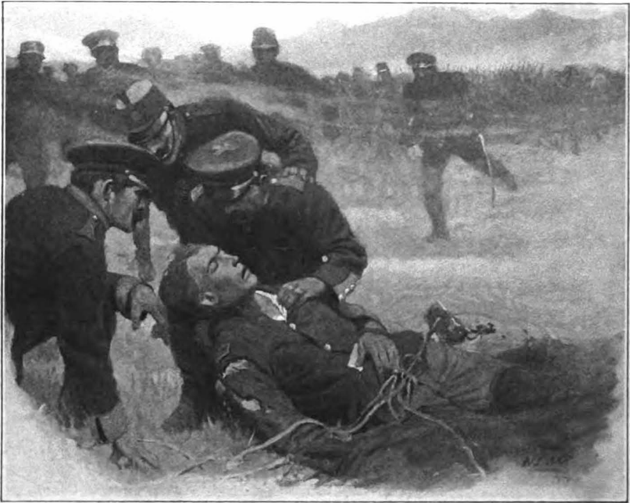
"It didn't work," he managed to say.—Page 137.

mist into streaky sunlight already breaking through the cloud she passed.