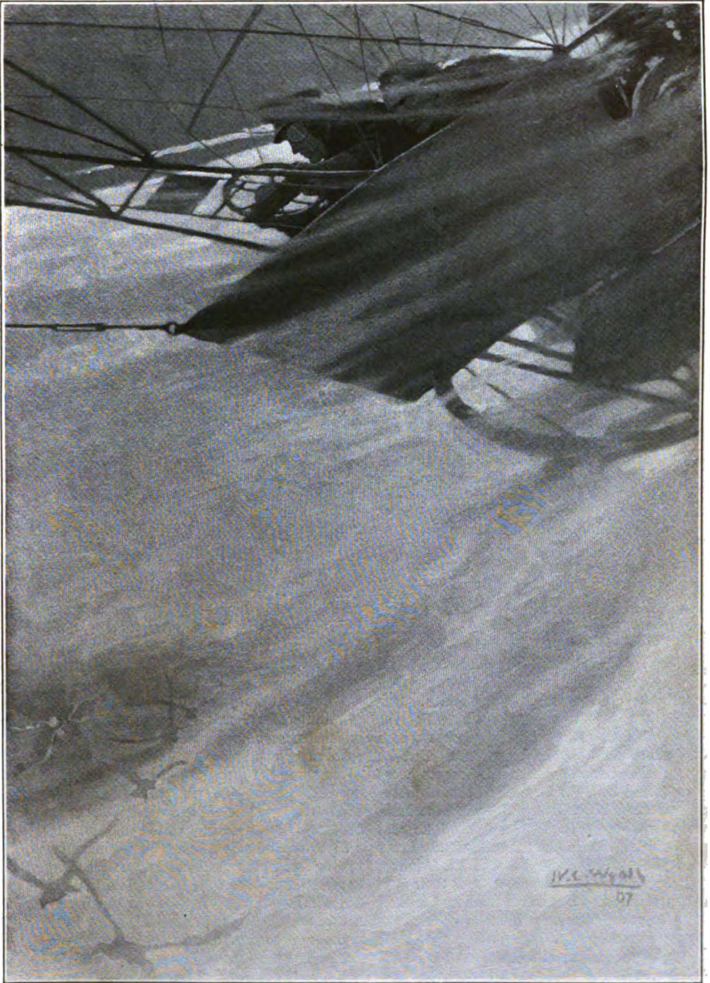
Drawn by N. C. Wyeth.

"The Chief," trimmed for flight, sprang downward at all speed.—Page 134