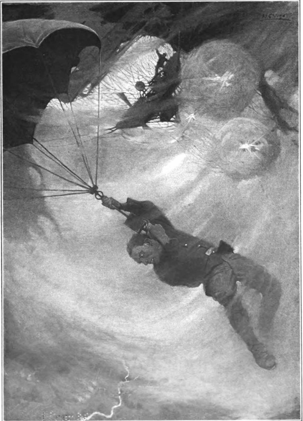
Illustration by H. S. 1916