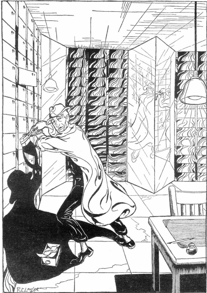
With both hands, the man manipulated the handles of the instrument until the jaws seemed to melt right into the thick steel walls of the vault. After a few seconds of probing, he withdrew the jaws of the Hyper-Force. Between them dangled a tin box which had been drawn right through the locked door of one of the safe deposit compartments.