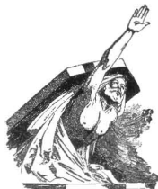
IGLES VERNE'S TOMBSOME AT AMIENS PORTRAYING HIS IMMORTALITY